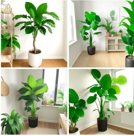
Pictured: Images made with Stability.AI's Stable Diffusion with the prompt: "Realistic Instagram photo of apartment full of green plants."

Plants are different and we should understand that. Nobody loses their soul via plant addiction. Plants re-orient us. They turn our eyes and our hearts toward what we know truly matters: our earth, our community and ourselves. Plants don't just improve reality; they cause us to feel affection for reality. This is important because we care for what we care about.