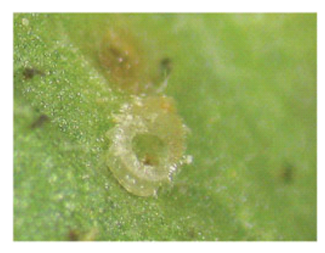
Figure 5. Greenhouse whiteflies that have been parasitized by Encarsia formosa turn black, so it's very easy to check that these wasps are active in your crop. Photo: Suzanne Wainwright-Evans.

Figure 6. Whitefly nymphs parasitized by Eretmocerus do not turn black. To check for activity, use a hand lens to look for round exit holes on whitefly pupae that indicate that a wasp has killed a nymph and chewed its way out of the pupa. This round exit hole will look very different from the Tshaped slit through which healthy adult whiteflies emerge from their pupal stage. Photo: Suzanne Wainwright-Evans.