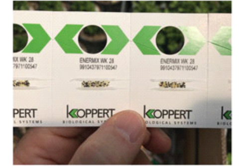
Figure 8. One way to release parasitoids is from Encarsia/Eretmocerus cards into your crop. Release boxes can also be deployed in a similar way. Be sure to keep the cards or boxes shaded, as dry as possible and inside the crop canopy, not above the canopy. Photo: John Sanderson.

Figure 7. Whitefly pupae that have been parasitized by the wasps are shipped glued to cards (or as loose pupae in sawdust carrier in bottles or blister packs). Wasps emerge from the pupae on these cards and fly into the crop to search for whitefly nymphs to parasitize or kill by hostfeeding. Photo: John Sanderson.