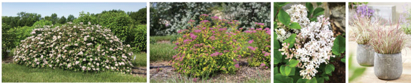
Pictured: Spot On Spirea, Little Spark Spirea, Bloomin' Easy Pearl Potion Lilac and Schizachyrium scoparium Chameleon Little Bluestem

followed by small black cherries in late summer. Very tolerant of full sun and dry conditions once established.