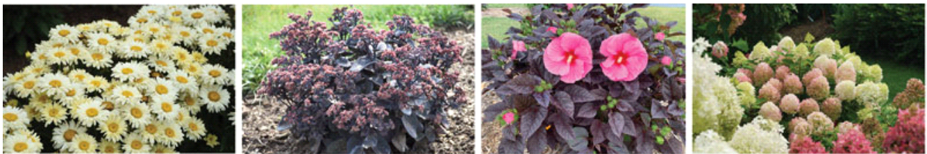
Pictured: Amazing Daisies Banana Cream II Leucanthemum, Back in Black, Summerific Edge of Night and Fire Light Tidbit

This modern shrub rose features deep red blooms with lots of petals and a classic heirloom rose fragrance. Brindabella Roses are resistant to black spot and powdery mildew, and combine the best traits of old-fashioned roses with modern disease resistance. Crimson Knight is a better option for those who want a true red rose—while Brindabella Red Empress will turn more fuchsia in warm temperatures, Crimson Knight remains a true dark red. Blooms are almost blackish red in the bud stage. suntoryflowers.com