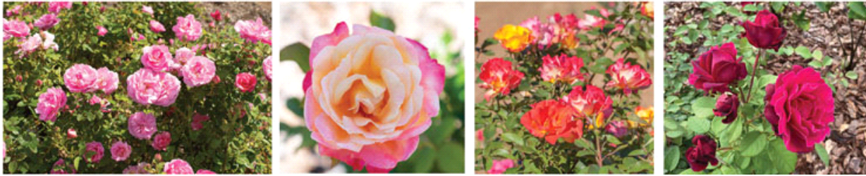
Pictured: Sitting Pretty, Enchanted Peace, Sunset Horizon and Brindabella Crimson Knight Rose