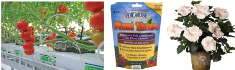
Pictured: Growbags, Plant Thrive and Earth Angel Hibiscus