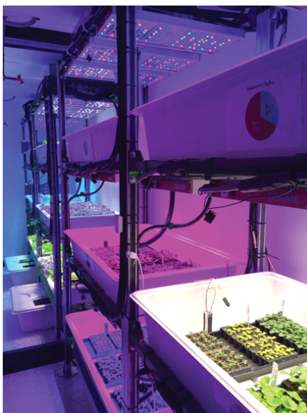
Figure 3. Research being performed with ornamental transplants in the Controlled Environment Lighting Laboratory at Michigan State University ( https://goo.gl/A2xGAa ).

In 2011, we started researching indoor LED lighting on seedling plugs using custom-designed LED growing modules (Figure 2). We've learned a lot about how different colors (wavebands) of light influence growth and subsequent flowering of floriculture crops. Research expanded in 2017 with the development of the Controlled Environment Lighting Laboratory at Michigan State University (Figure 3).