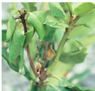
Phytophthora on rhododendron.