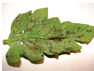
Aerial Phytophthora on a tomato leaf.