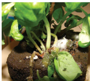
Rhizoctonia web blight on basil.

Plants are subject to an array of foliar diseases: blights, root and stem rots, bacterial infections, wilts, viruses and nematode diseases. Symptoms that appear on afflicted plants are clues, but unless a telltale sign of the causal organism is present, identification can be challenging without microscopic examination. The same goes for pathogens affecting roots.