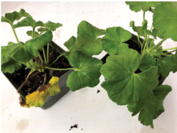
Botrytis trial on geranium. Left: untreated; right: Broadform 4 oz./100 gal.

Fluopyram is categorized under FRAC code 7, which includes succinate dehydrogenase inhibitors (SDHIs). However, fluopyram is the only pyridinyl ethyl benzamide SDHI fungicide—making it a powerful tool in the resistance-management toolbox.