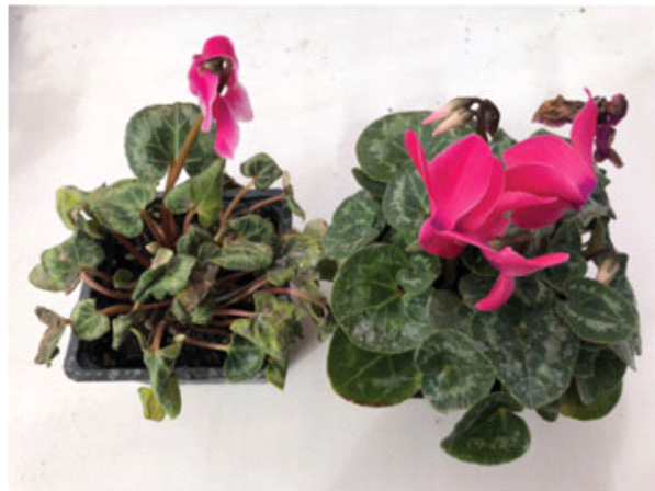
Anthrachnose trial on cyclamen. Left: untreated; right: Broadform 4 oz./100 gal.

The chemical structure of fluopyram is unique and 100 times more flexible than carboximide SDHI fungicides, enabling the molecule to better bind to fungi on a cellular level. Because of this ability, fluopyram can still remain effective in instances where structural mutations have resulted in resistance to carboximide SDHI fungicides, making Broadform an excellent choice for resistance management. And as an added benefit, Broadform contains two active ingredients, combining fluopyram with trifloxystrobin, to both increase the spectrum of disease control