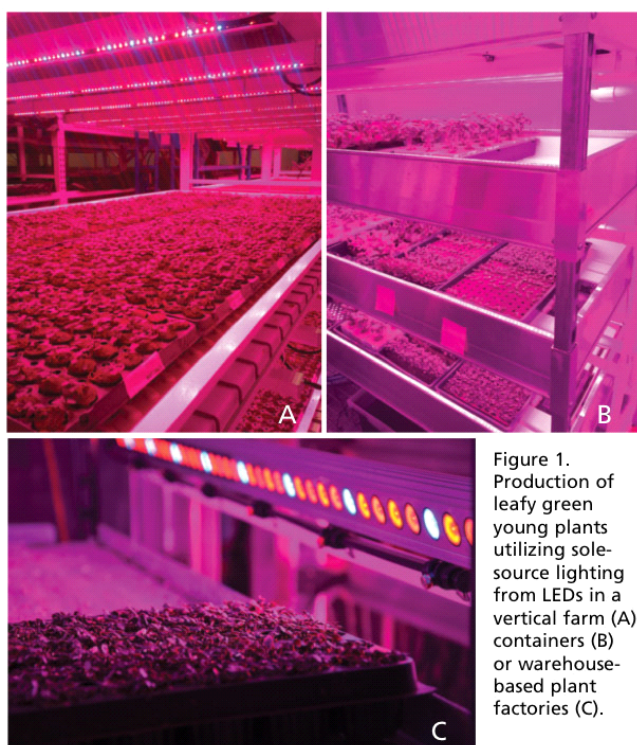
Figure 1. Production of leafy green young plants utilizing sole-source lighting from LEDs in a vertical farm (A), containers (B) or warehouse-based plant factories (C).

In the final article of this four-part series, we'll focus on the production of young plants in highly-controlled environments.