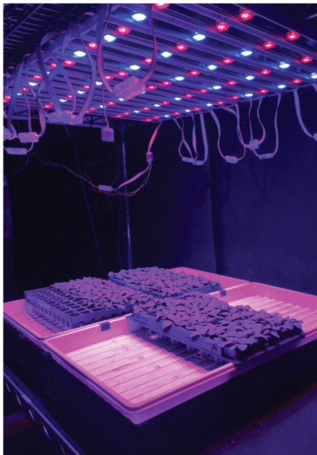
Figure 2. Petunia Dreams Midnight seedlings under light-emitting diode (LED) sole-source lighting (SSL) using a multi-layer vertical production system.

the sun. In other words, all of the light supplied to the plants comes from electric lamps, such as light-emitting diodes (LEDs). Unlike a greenhouse, this method of production can enable the grower to precisely control most, if not all, environmental parameters and, in turn, increase the uniformity and consistency of production.