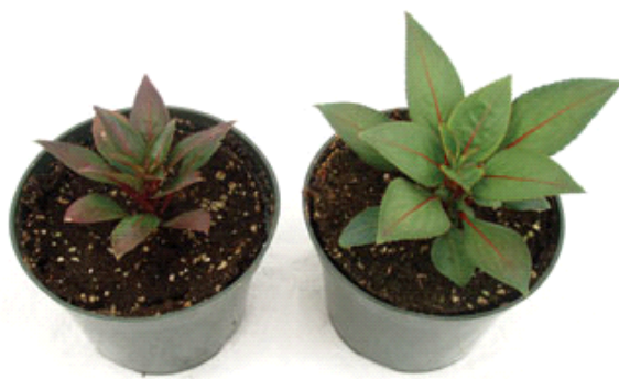
Figure 2. Tamarinda Dark Red New Guinea impatiens grown without P (left) were significantly stunted compared to healthy plants grown with sufficient P (right) and displayed classic symptoms of P deficiency on the lower leaves.

didn't reach flowering. Symptoms of P deficiency were present on this dark-leaved cultivar, but were much more pronounced on the light-leaved Tamarinda Dark Red (Figure 2). Additionally, you can see that plants grown with a PGR were more compact than plants grown with the same P rate and no PGR (Figure 1).