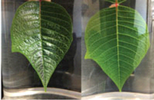
Figure 3. Comparison of a poinsettia leaf submerged in water (left) or an adjuvant (right). The waxy leaf cuticle causes a layer of air to form between the leaf and the water resulting in a silvery appearance that's not seen when leaves are submerged in an adjuvant solution.

Figure 2 demonstrates the rate at which water penetrates a poinsettia cutting, resulting in increased turgor pressure and reduced wilting. Submerging cuttings in water has little effect on rehydration since water doesn't readily penetrate the waxy leaf cuticle. Figure 3 (left) shows the appearance of a leaf submerged in water. The waxy leaf cuticle causes a layer of air to form between the leaf and the water resulting in a silvery appearance that's not seen when leaves are submerged in an adjuvant solution (right). Adjuvants reduce the surface tension of the water, allowing it to come in direct contact with the leaf. This results in a different perception of the leaf color in the solution and rapid water penetration across the cuticle and into the leaf tissue.