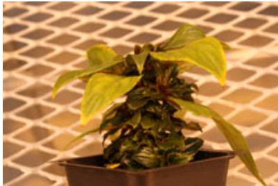
Left: Figure 2. The highest concentrations of some PGRs resulted in overregulation of growth, such as this plant treated with 20 ppm of uniconazole.

We found that flurprimidol, paclobutrazol and uniconazole resulted in plants that were shorter than untreated plants (Figure 1). Depending on the active ingredient, concentration and cultivar, plant height was 18% to 48% shorter compared to untreated control plants when these PGRs were applied. However, the highest concentration of uniconazole resulted in severe overregulation (Figure 2). Similarly, the highest concentrations of flurprimidol, paclobutrazol and uniconazole caused a delay in flowering for some of the cultivars.