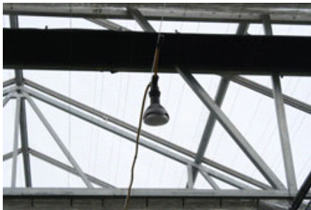
Figure 3. Light-emitting diodes (LEDs) are a new technology with great promise for use in photoperiodic lighting.

High-intensity discharge (HID) lamps. HID lamps, such as metal halide and HPS lamps, may also be used effectively. There are several ways to use these lamps to provide DE and NI lighting. Most commonly, HPS lamps are suspended above the crop. Another method is to mount HPS lamps on booms that move over the crop. The newest development in HPS lamps is to use an oscillating reflector (Figure 2). When using an HID lamp, such as HPS lamps for photoperiodic lighting, you may be providing supplemental or photosynthetic light as well, depending on the intensity of the light and the hours of operation. See the article in the March 2014 issue of GrowerTalks on supplemental lighting for more information.