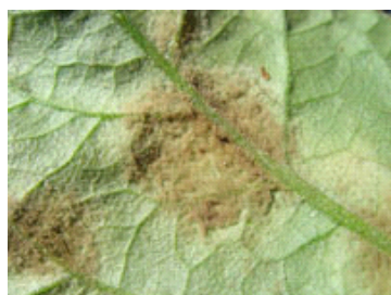
Figure 3. Close up of the spores on the underside of a leaf with tomato leaf mold.

In addition to confusing with powdery mildew, growers may confuse leaf mold with grey mold caused by Botrytis cinerea . B. cinerea has more powdery spores than those observed with F. fulva . The fungal growth of B. cinerea is fluffier than with F. fulva . Even though powdery mildew infections usually begin with pale green or chlorotic areas on leaves, they can be differentiated from B. cinerea and F. fulva by the appearance of diffuse powdery patches, which often occur on upper and lower leaf surfaces. B. cinerea may colonize leaves already infected by F. fulva , masking the leaf mold symptoms and making the diagnosis more challenging.