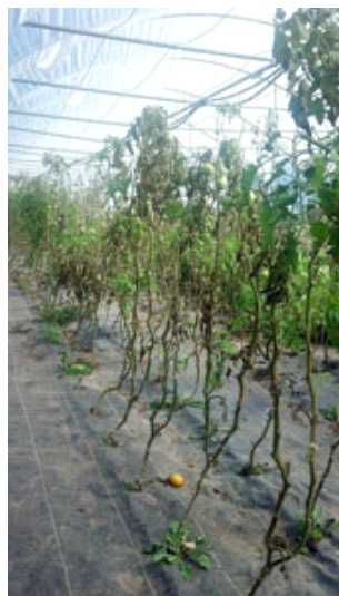
Figure 4. Tomato leaf mold killing tomato plants in a high tunnel.