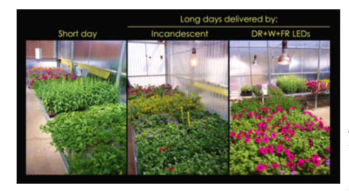
Figure 1. Setup of treatments, including a natural short day and a 4-hour night interruption from incandescent or the Philips deep red + white + far red (DR+W+FR) LEDs, at the Center for Applied Horticulture Research at Altman Plants.

Upon receipt, each grower transplanted the plants into 1801 trays using their typical growing media for bedding plant production and placed four trays of each crop under each treatment. All plants were grown under similar environmental conditions following the growers' standard production practices of watering, fertilization and pest management. The average daily temperature ranged from 62F (16C) at Krueger-Maddux Greenhouses to 71F (21C) at CfAHR. The average daily light integral (DLI) ranged from 9 mol·m-2·d-1 at Henry Mast Greenhouse to 20 mol·m-2·d-1 at CfAHR. Applications of plant growth retardants were at the discretion of the growers, and if an application was made, it was the same in all treatments.