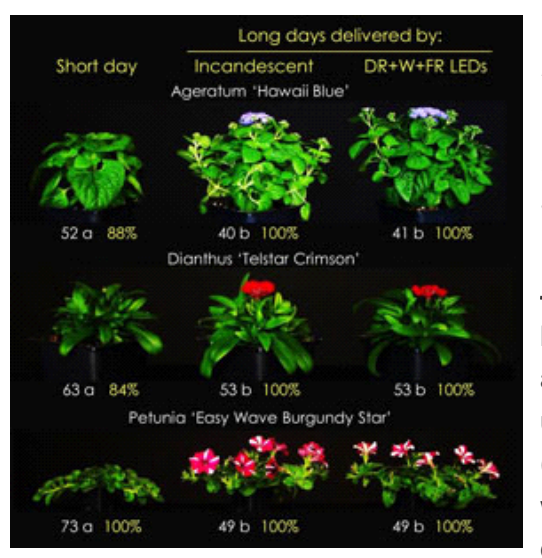
Figure 3. Ageratum, dianthus and petunia grown under 9hour short days without or with a 4-hour night interruption from incandescent or the Philips deep red + white + far red (DR+W+FR) LEDs at Michigan State University. Average days to flower followed by different letters (in white font) are significantly different. Flowering percentage is in yellow font.

MSU —Ageratum, dianthus, petunia Easy Wave Burgundy Star and Wave Purple Classic, and snapdragon flowered similarly under the INC lamps and LEDs and earlier than under short days (Figure 3). The flowering responses of calibrachoa and dahlia were inconsistent in the two greenhouses. Verbena flowered earlier under the INC lamps and LEDs than under short days; but