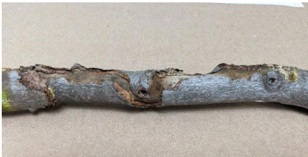
The trunk of a maple tree severely girdled by a flatheaded appletree borer.

To improve the management of these flatheaded borer pests, the Flatheaded Borer Working Group has been conducting research to understand the causes of borer attacks on nursery, landscape and orchard trees, and to provide improved recommendations for management. I'm part of the project, which is funded by a Specialty Crop Research Initiative (SCRI) Grant from USDA National Institute for Food and Agriculture. This project covers not only ornamental trees, but also fruit and nut trees, such as walnut on the West Coast, and blueberry, peach and pecan in the Southeast.