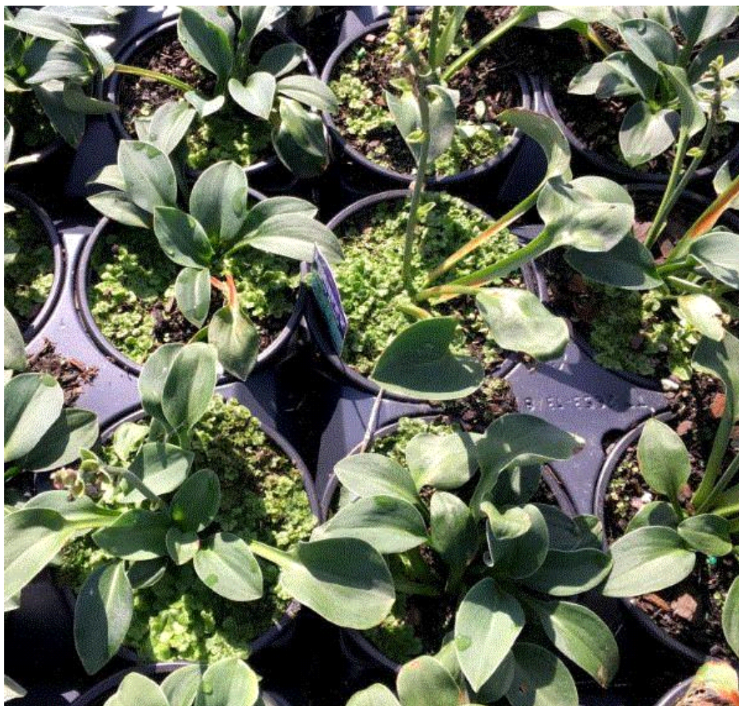
Liverwort in containerized plants.

What's undeniable is liverwort's impact on containerized plant production, particularly those with a longer production cycle. Liverwort competes with plants for water, nutrients and growing space. It's rather ugly to look at to boot. Management using herbicide may be tricky because you may have to worry about the herbicide getting in contact with and damaging plants.