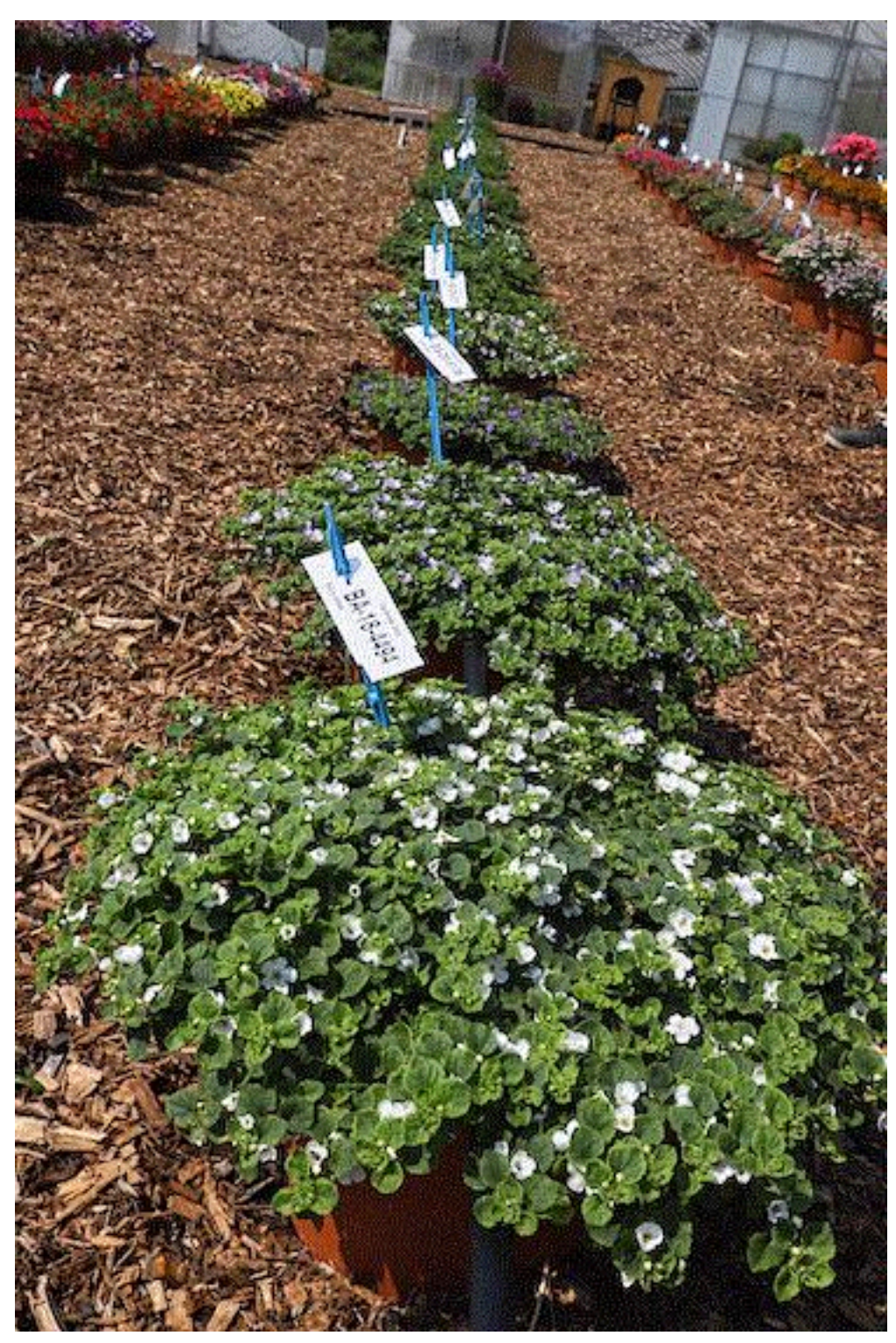
The new ones (showing flowers despite the heat) are in the foreground.

had some flowers while all the others were just green. We might see this introduced in 2023 for '24.