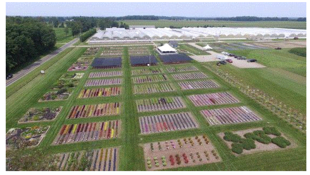
Raker-Roberta's, one of our seven stops during our three-day tour.