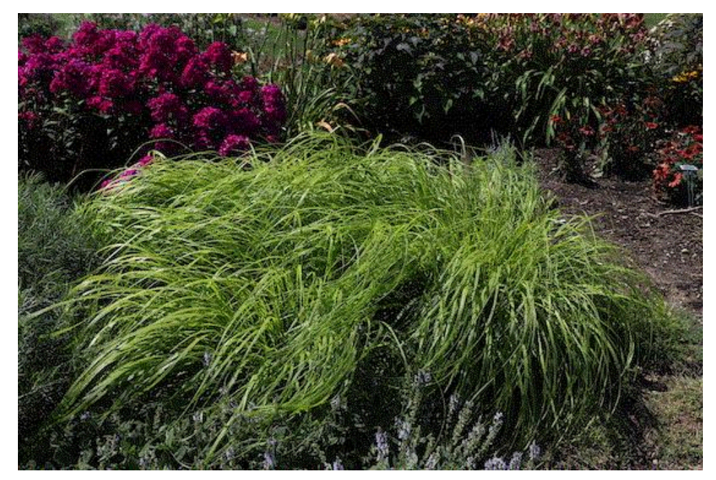
Pennisetum Prairie Winds Lemon Squeeze.

Lastly, we got a sneak peek at Astilbe Darkside of the Moon (not to be confused with the Pink Floyd album of the similar name). Like Back in Black, it's got dark, dark foliage. Blooms are purply-pink.