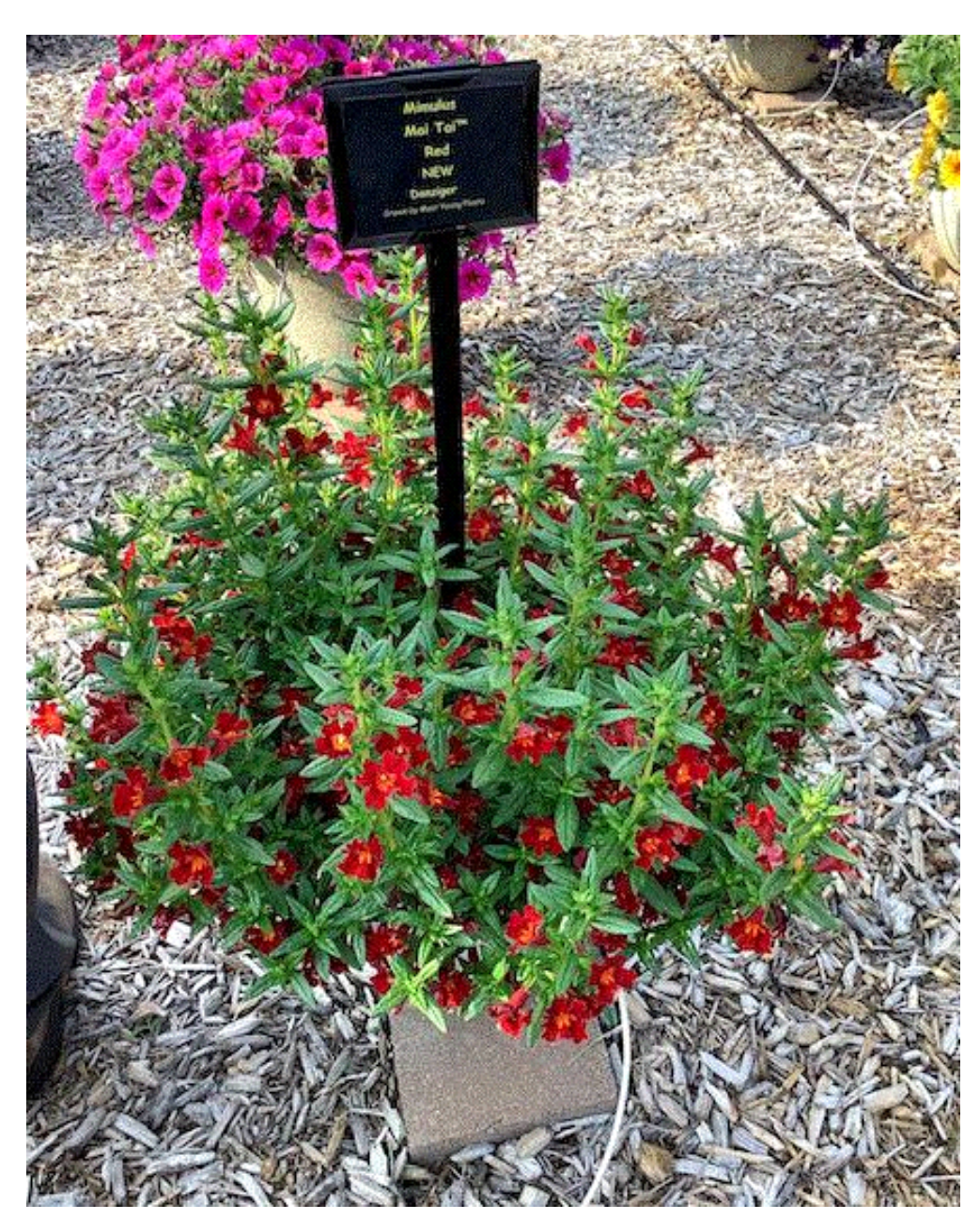
Mimulus Mai Tai Red (above) and Petunia Crazytunia Mayan Sunset (below).