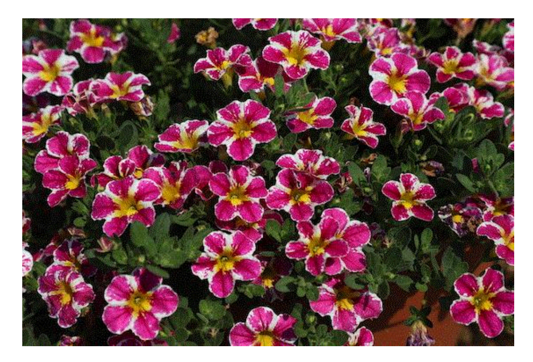
Jen: Lastly, how about that large display of Danziger's Durabella combinations? These are designed for low input costs—three liners will fill out a 12-in. basket or tub in 12 weeks or less. We liked Durabella Ombre Sundown (below), featuring three of the Colibri Ombre colors.