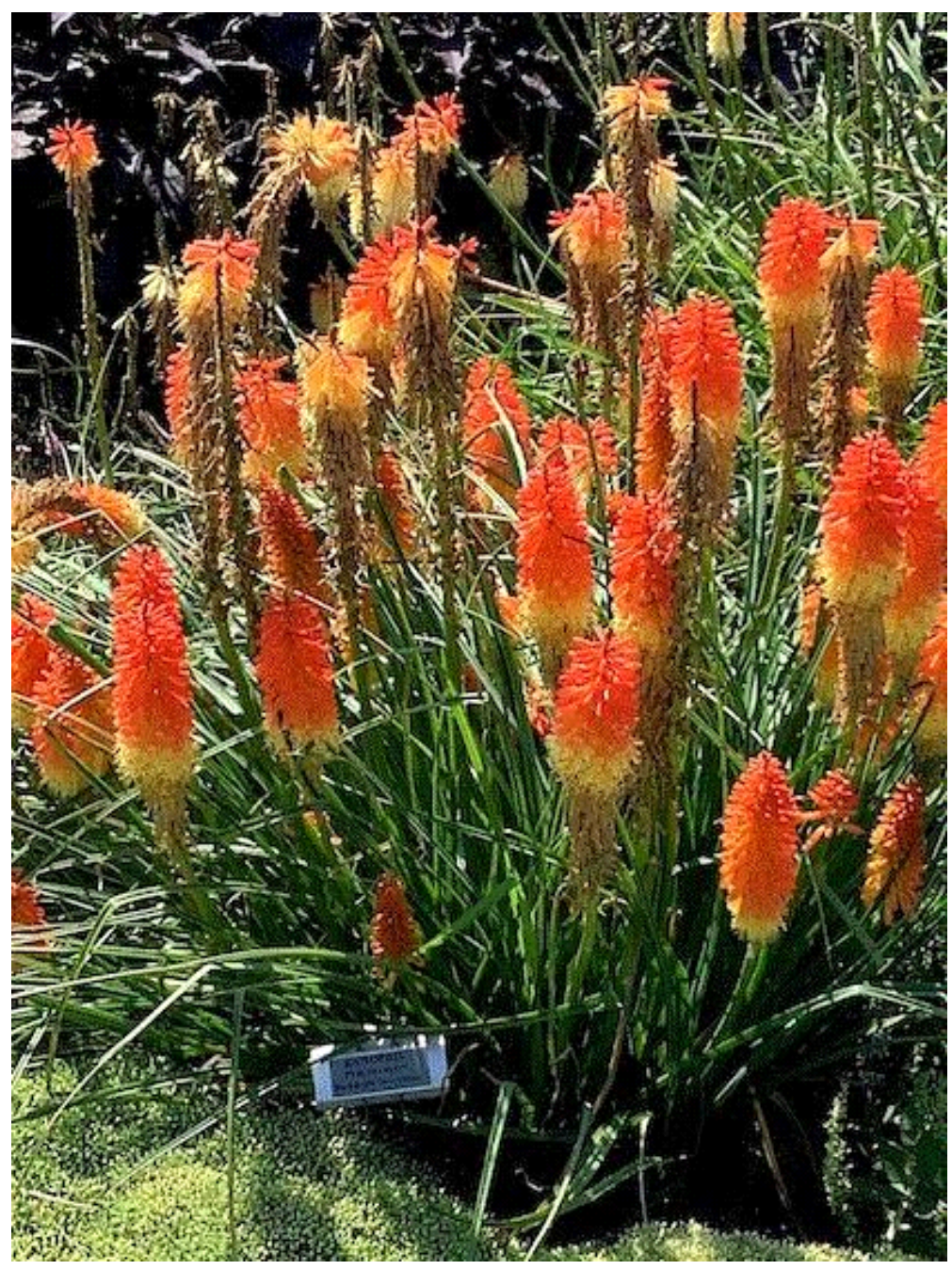
Kniphofia Pyromania Backdraft.

Pennisetum Lemon Squeeze is part of Proven Winners' Prairie Winds collection. This fountain grass has striking gold foliage (which doesn't burn in the sun, they say) topped with copper panicles starting mid-summer.