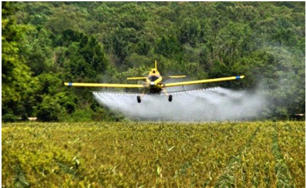
Dicamba aerial application.

And while a lot of ornamental growers in particular have suffered tremendous losses due to Dicamba drift, its eventual fate is long from sure. For example, the U.S. Environmental Protection Agency just Wednesday of this week put out a memo saying that they'll allow use of Dicamba products purchased before June 3 until July 31. The national Farm Bureau Association is beating down the new fence around the White House to get the President involved and many farmers say they'll use what they have until it runs out, to heck with the EPA and their arbitrary dates.