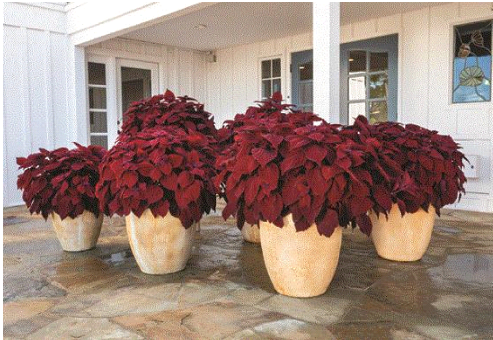
Coleus Beale Street—an AAS winner!