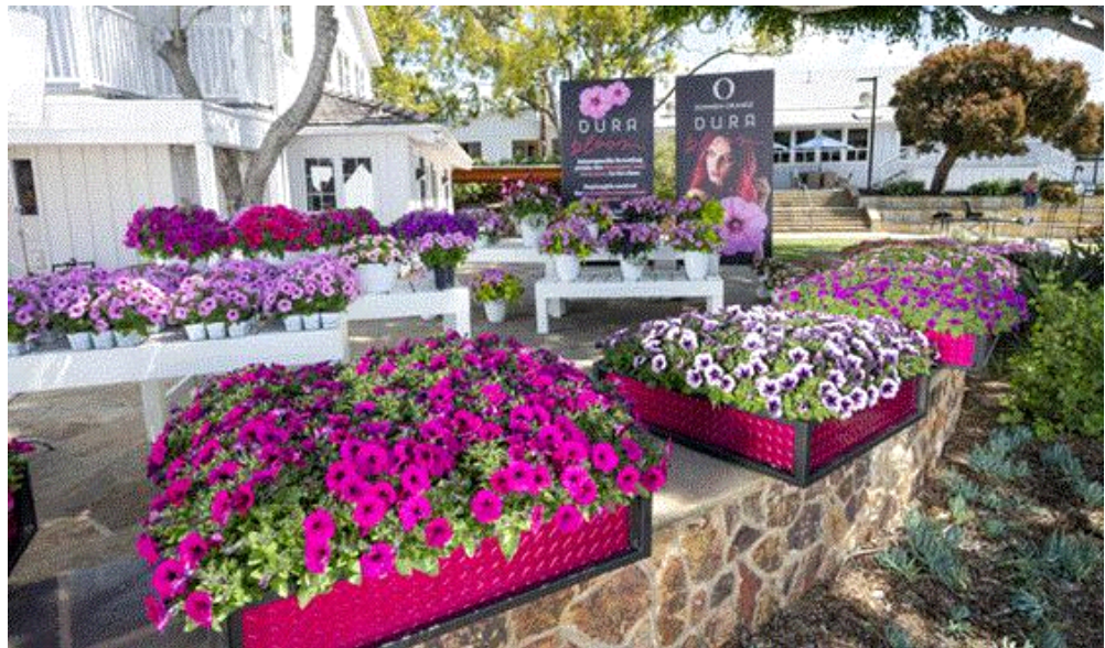
The name DuraBloom means durable and pretty.