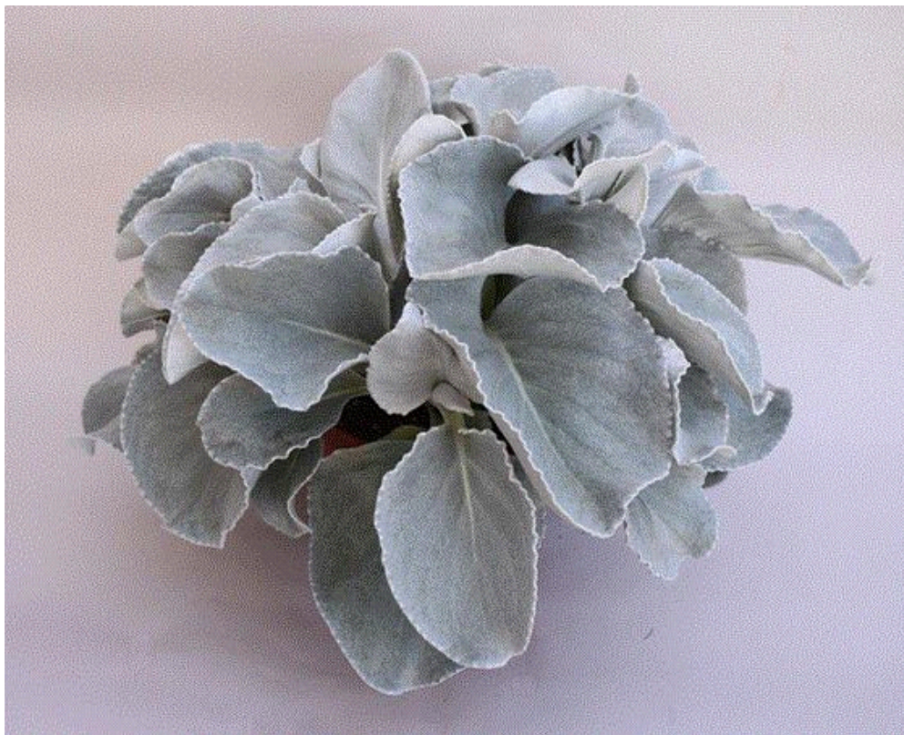
Senecio Angel Wings (from URCs)