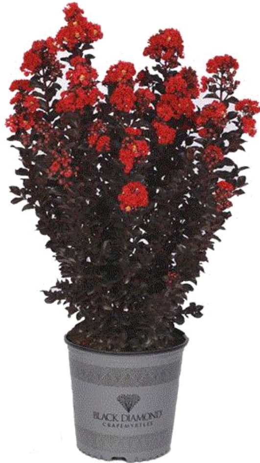
Crape Myrtle Black Diamond Radiant Red