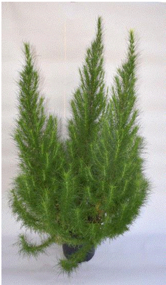
Eupatorium Elegant Feather