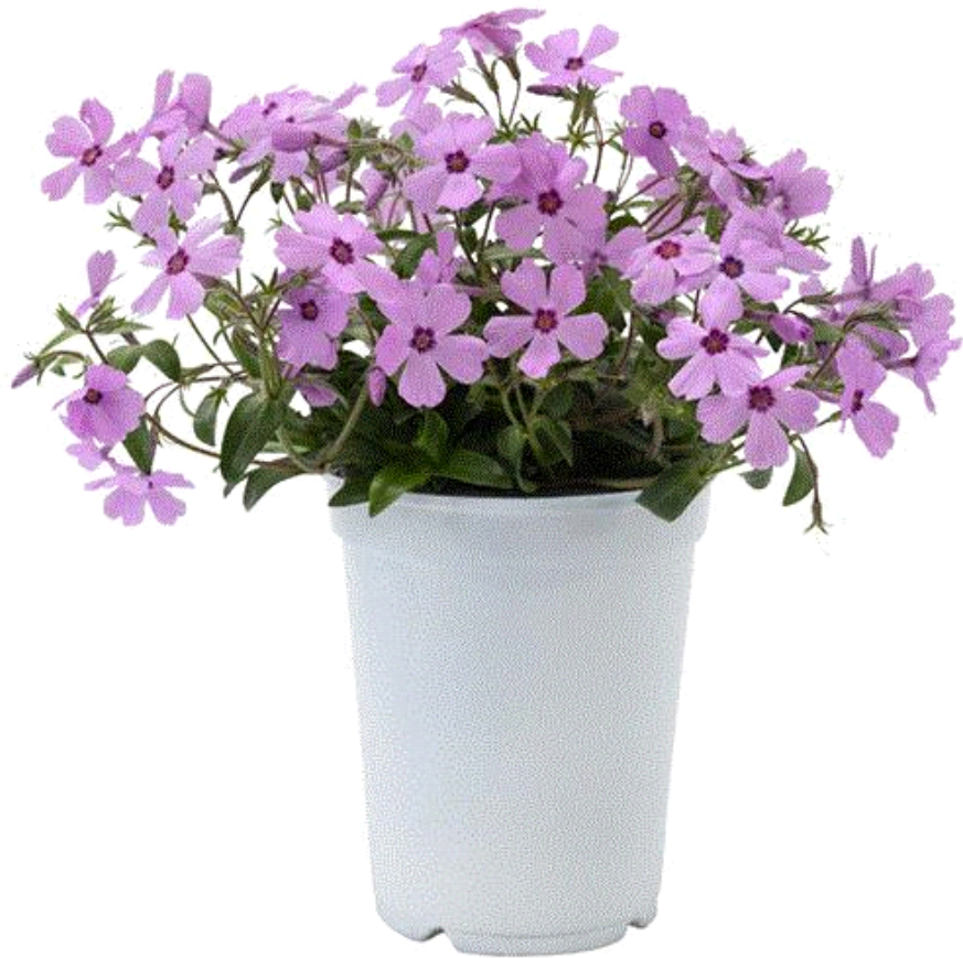
Phlox Woodlander Rose