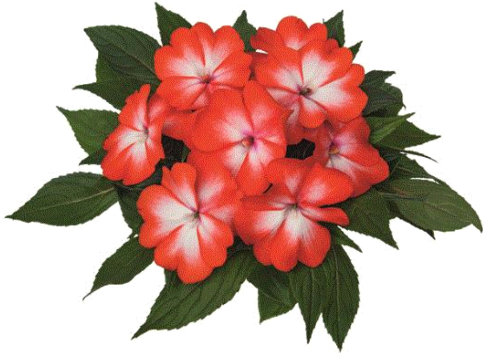
New Guinea Impatiens Paradise Orange Splash

Steve made a couple of Kientzler variety videos for your viewing pleasure: one on FLOWERS and one on FOLIAGE .