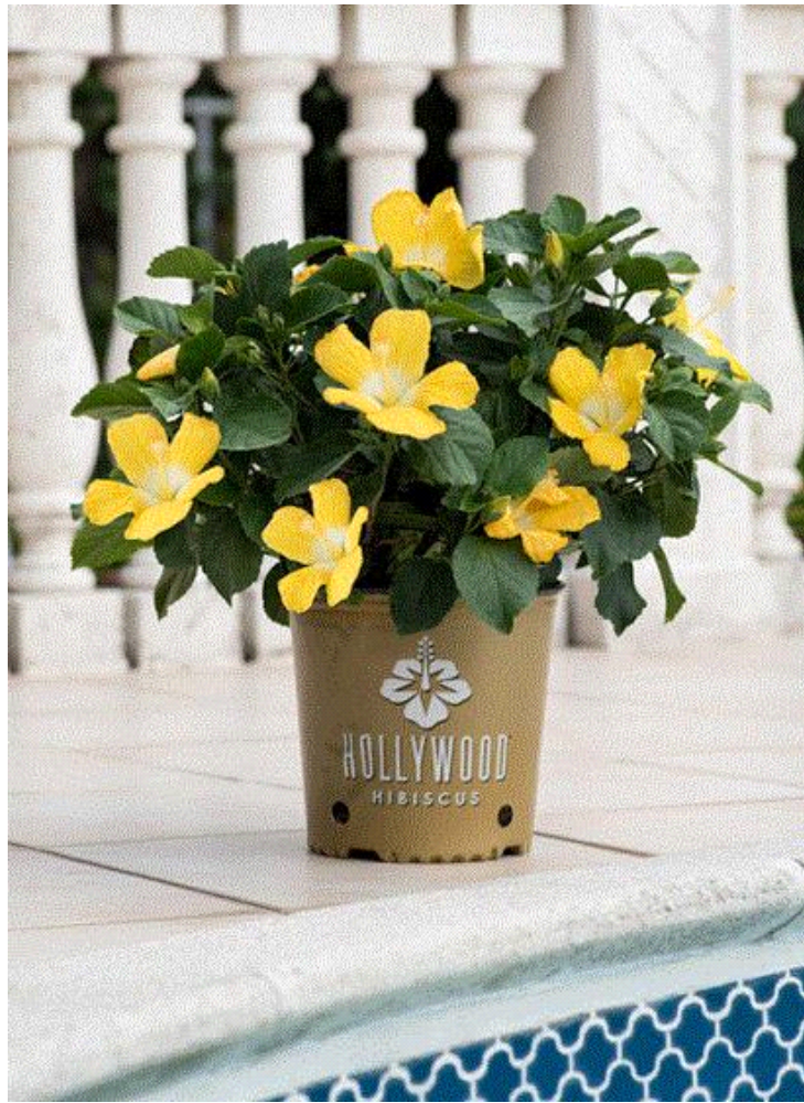
Hibiscus Hollywood Leading Lady

Also new from J. Berry is a new addition to their Black Diamond Crape Myrtle line. Radiant Red is naturally vigorous with large black leaves and ruby red flowers. Use this drought- and heat-tolerant plant as a hedge, focal point or container item.