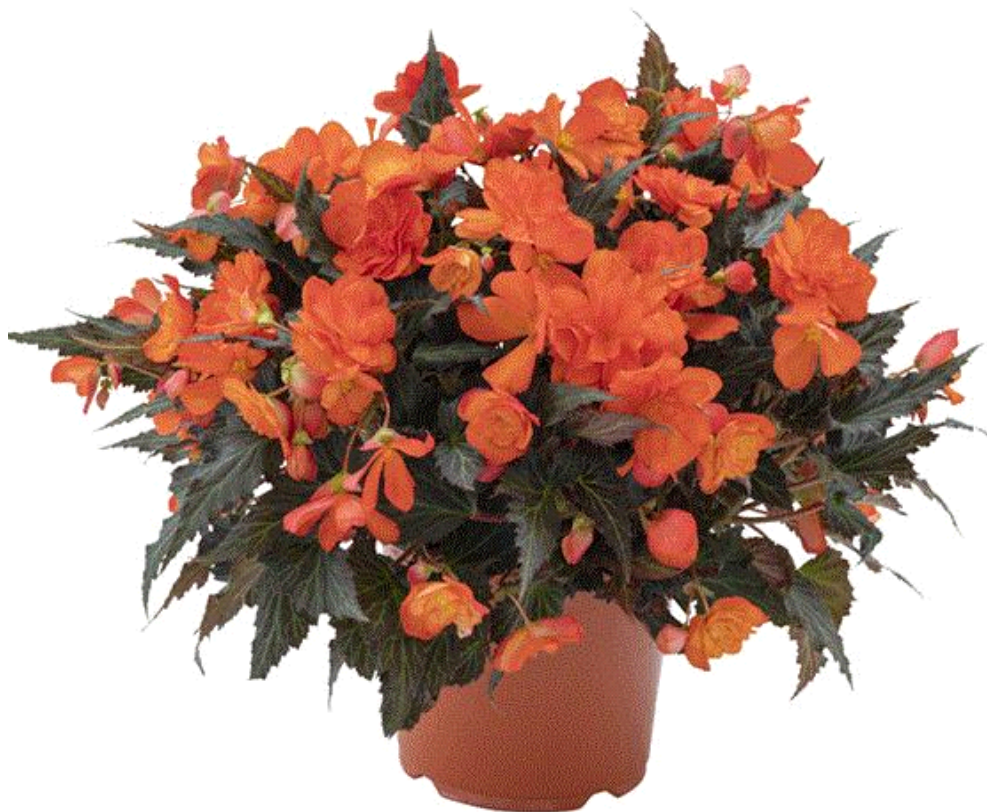
Begonia 'Conia Bacio Orange

Next up is an addition to the Roller Coaster New Guinea Impatiens series. Roller Coaster Hot Pink, with its large, double, curvy-margined petals was introduced last year. This year, five new colors join Hot Pink: Cotton Candy, Racer Red, Valravn Violet, Tangy Taffy and White Lightening. That curly edge really is different!