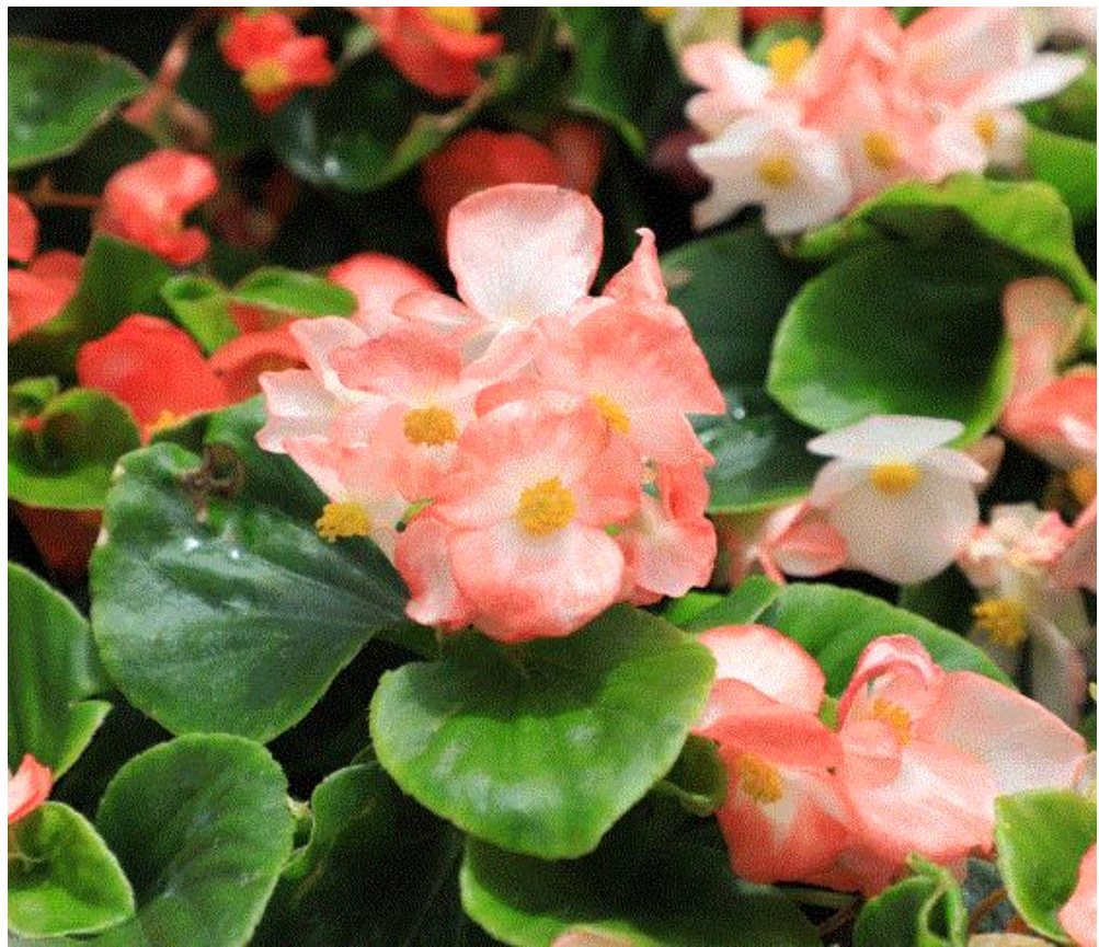
The Funky site-specific begonias—combining the ease of boliviensis and the flower power of tuberous—adds two colors: White and Orange.