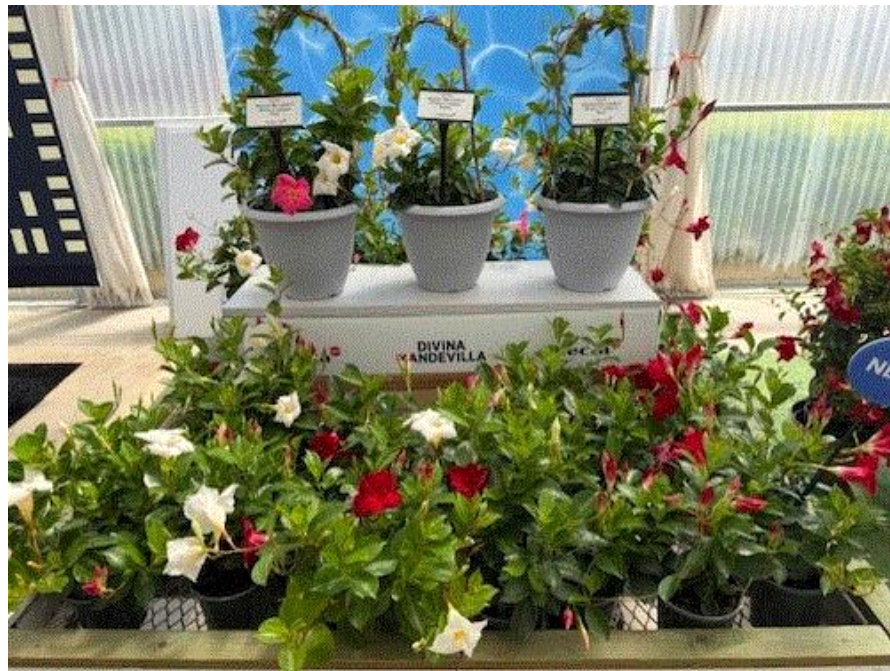
Looks like Compacts are on top and MegaFlora are on the floor.

The second subseries is on the other side of the size spectrum. Divina Compact is a bush-type mandevilla good for quart or gallon production. Lots of flowers on this one with strong branching. Colors are Pink, Red and White.