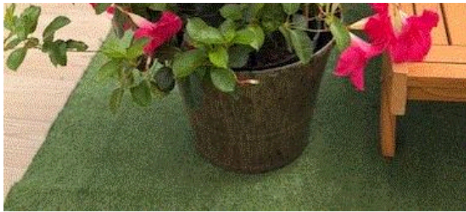
Divina Neon Pink

The second subseries is on the other side of the size spectrum. Divina Compact is a bush-type mandevilla good for quart or gallon production. Lots of flowers on this one with strong branching. Colors are Pink, Red and White.