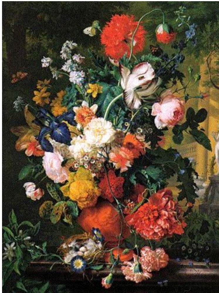
One of Rachel Ruysch's incredible paintings. They are breathtaking in person.

I am lucky that Toledo, Ohio, is my hometown, as it is home to one of the top-ranked art museums in the country, the Toledo Museum of Art. USA Today ranked TMA the Best Art Museum in the USA this year.