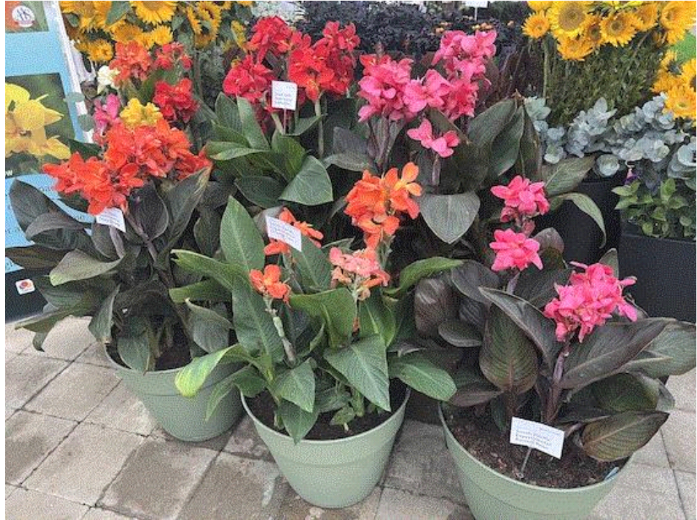
Takii is working on new colors for the South Pacifics, and these include Experimental Deep Orange, Experimental Orange Gen 2, Experimental Scarlet Gen 2 and Experimental Bronze Rose.