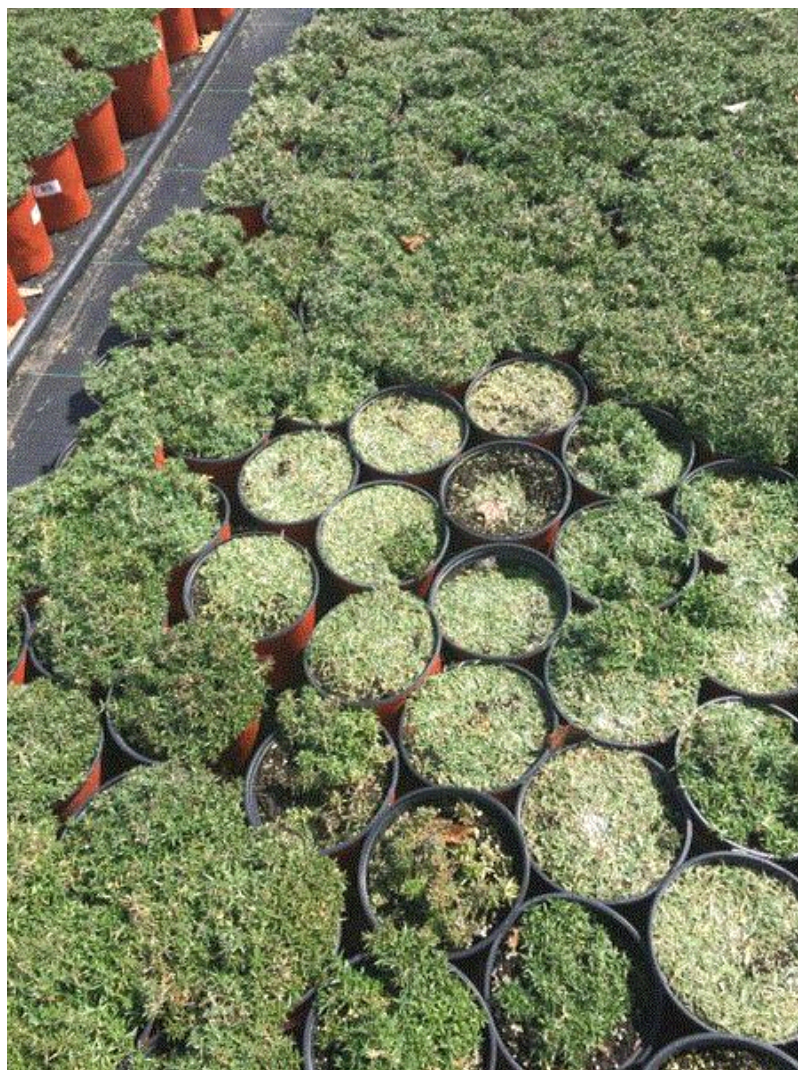
Rodent damage to Phlox subulata overwintered under protective blankets.

When overwintering perennials, especially when using protective coverings, it's essential to have a rodent management plan in place to lessen or alleviate the injury and/or losses rodents can cause. Let's look at the options available to growers.