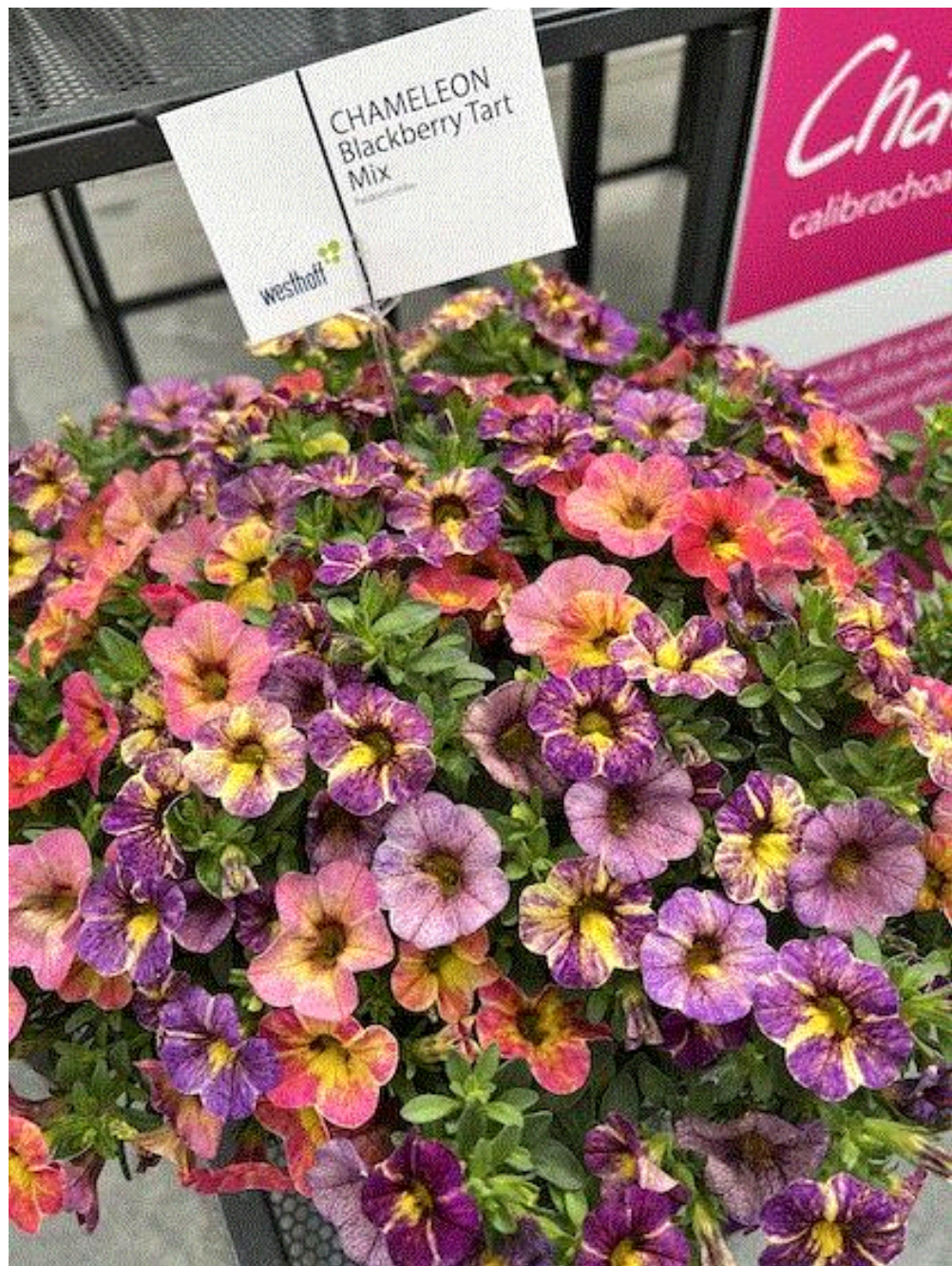
Calibrachoa Chameleon Blackberry Tart Mix