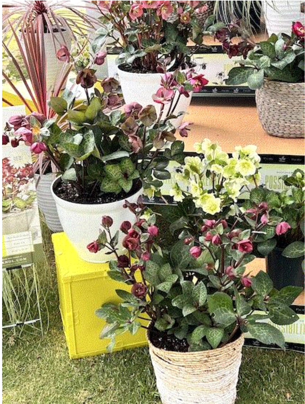
Hellebore Winter's Angels Vibey Velvet

greenhouse in Watsonville when space became a premium during spring production. My favorite at PP&L was their newest hellebore, Vibey Velvet. It's part of their Winter's Angels collection of early blooming (December/January) hellebores. It's got dark rose flowers, grows 12- to 18-in. tall and wide, and grows in Zones 5 to 8. It joins Charmer in the Winter's Angel series.