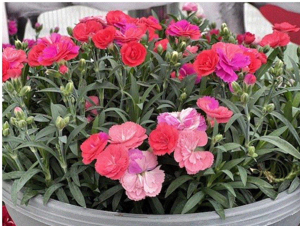
Constant Cadence Potpourri Dianthus

Bill: Now that you know a bit more about Green Fuse's new location, let's talk about some of their intros for 2023. I'll start with a colorful one, Dianthus Constant Cadence Potpourri. The Cadence series is known for interesting colors, but this variety really takes the cake. The blooms open in multiple colors, including pink, rose and orange on one plant—in fact, each bloom can have multiple colors within the petals! The variety looks like a mix, but it's not a mix.