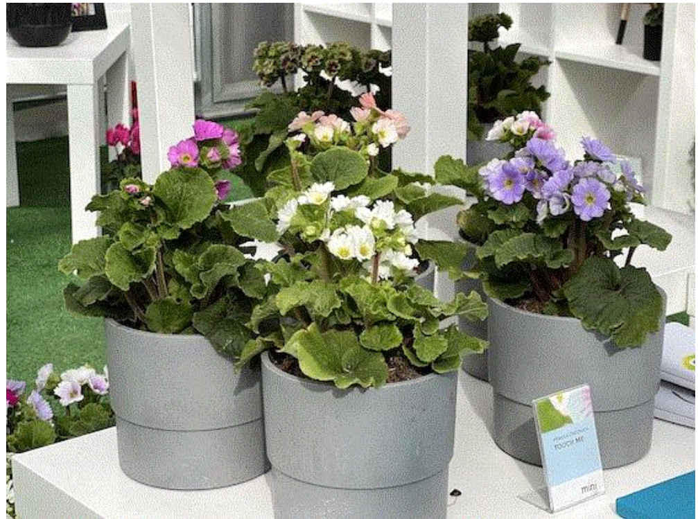
Touch Me Mini Primula

Chris: Moving on to Westhoff, the German breeder of many colorful annuals, I want to focus on their calibrachoa, which offer some of the brightest color patterns you'll see anywhere, such as my favorite, Chameleon Blackberry Tart Mix (not new, but definitely wild!). They've got the Chameleons, which feature exciting multicolors; and Calitastic, the more typical calibrachoa. New colors in Calitastic include Tricolor Pink, Bright Red, Merry Cherry and Violaceous. There are also some cool standalones, including Illusion, Dracula and Caramel.