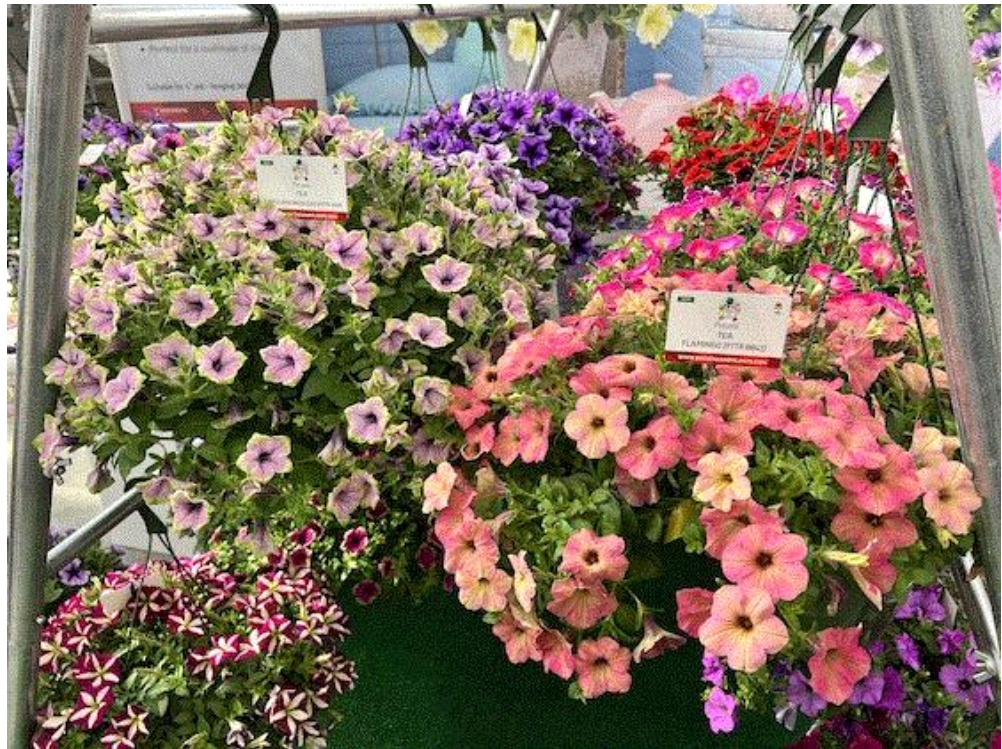
Petunia Tea Purple Vein Green Edge and Flamingo