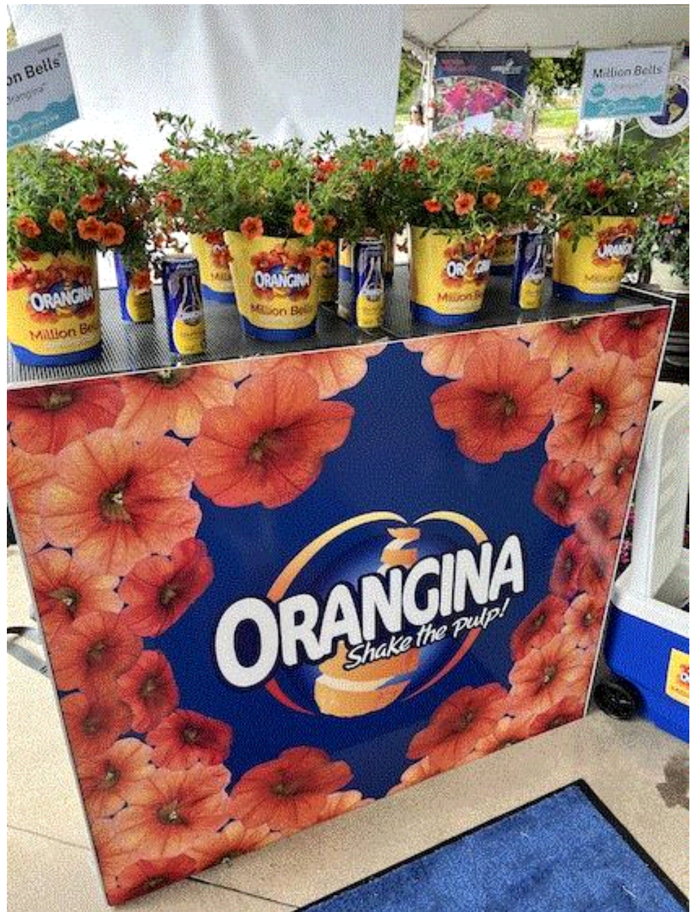
Calibrachoa Million Bells Orangina