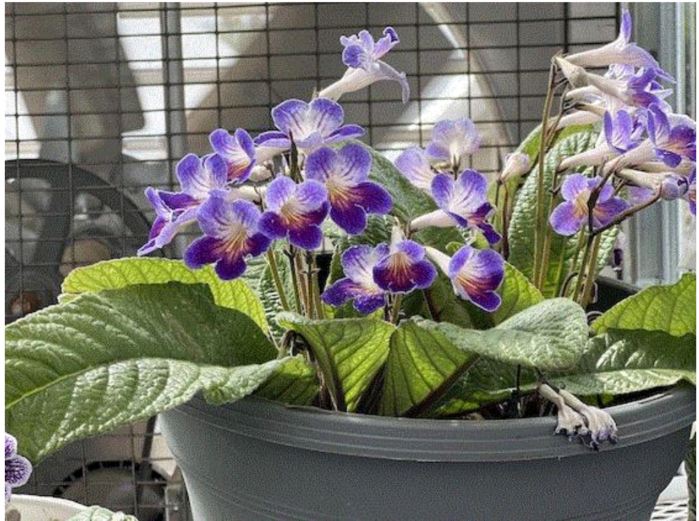
Streptocarpus Ladyslipper Azure

off along with all the other houseplants.