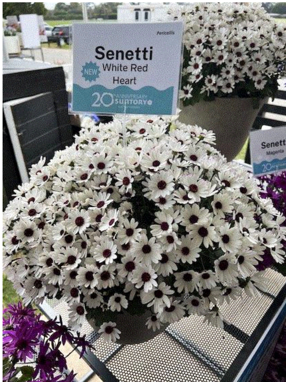
Senetti White Red Heart Pericallis

Bill: The Senettis are nice, but I'm glad you didn't take my favorite, the Surfinias. This year, they introduced a new series called Heavenly. It's a semi-trailing type with uniform vigor, habit and timing across four colors—Amethyst Burst, Cabernet, Blue and Deep Red. They also have a couple new additions to the vigorous XXL Surfinia series—Salmon Vein and Watermelon Jazz.