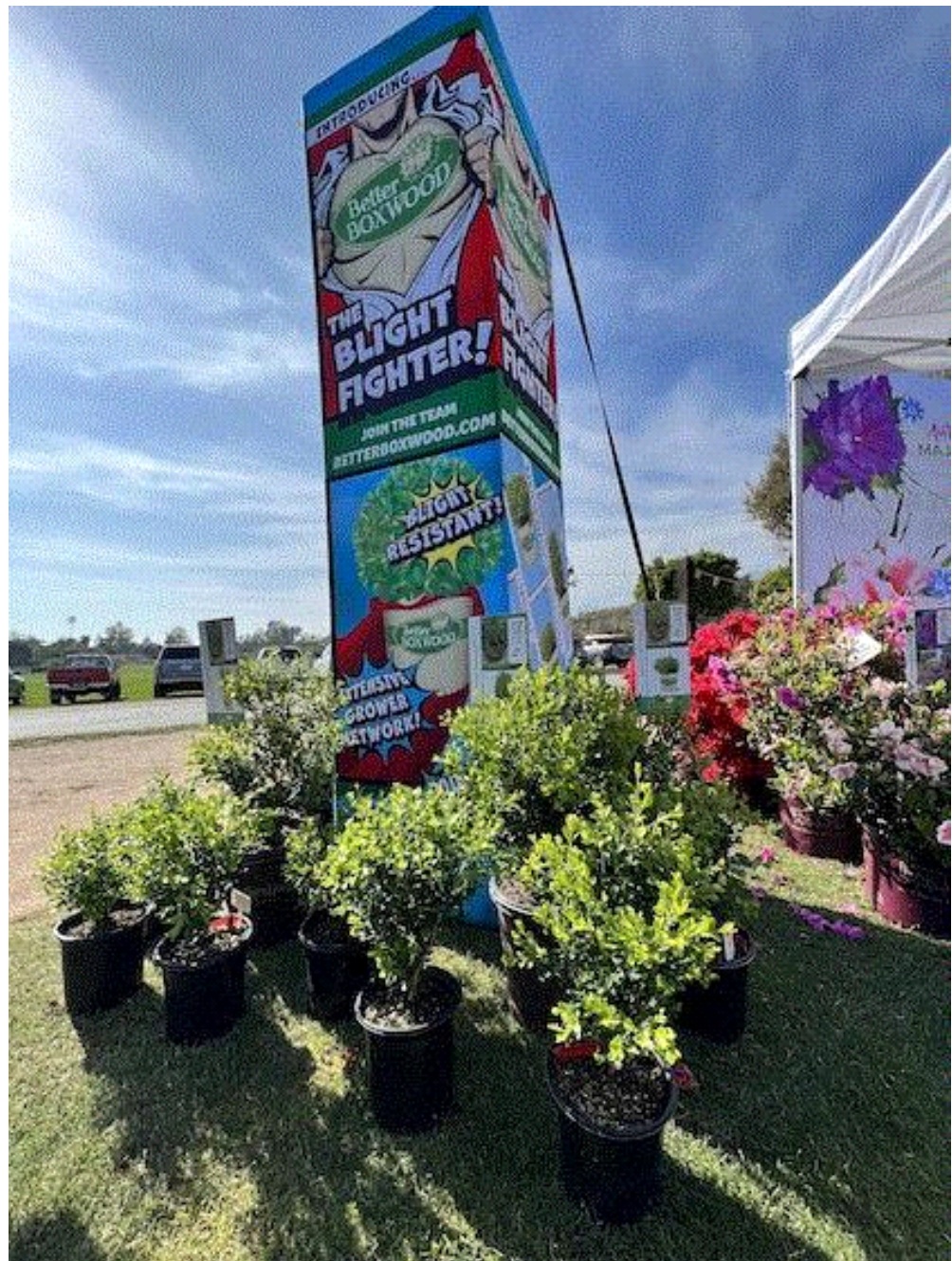
Better Boxwood program