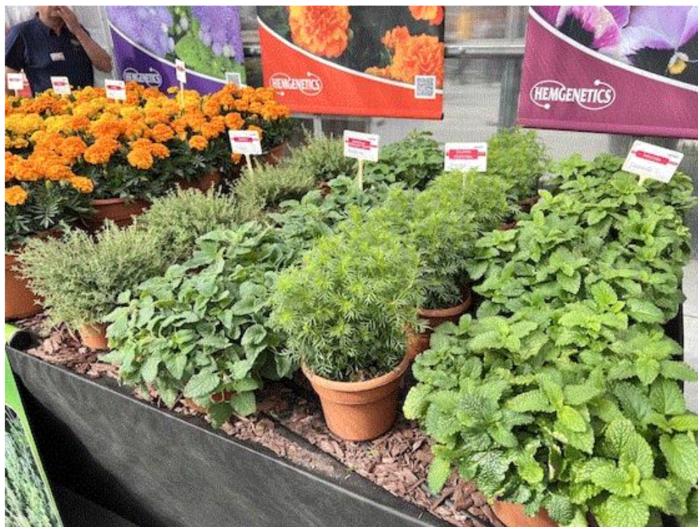
The tagetes is the tall one in the middle.