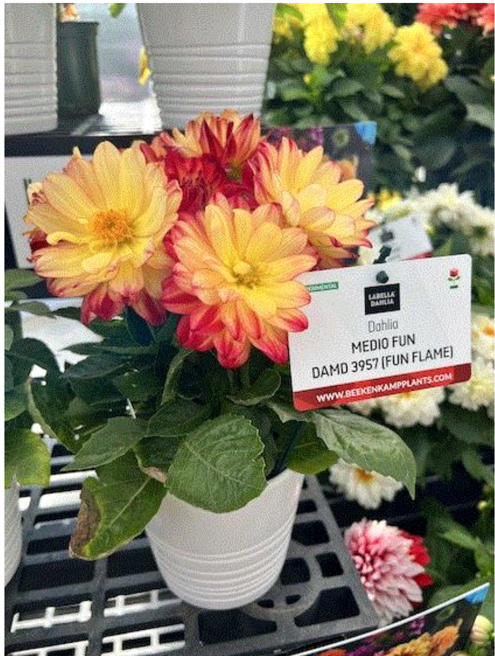
Dahlia Medio Fun Flame

Chris: Beekenkamp also showed a couple new unique-colored petunias in their Tea series for weather-tolerant containers from 4-in. up to baskets: Purple Vein Green Edge and Flamingo. Both are nice color additions to the series.