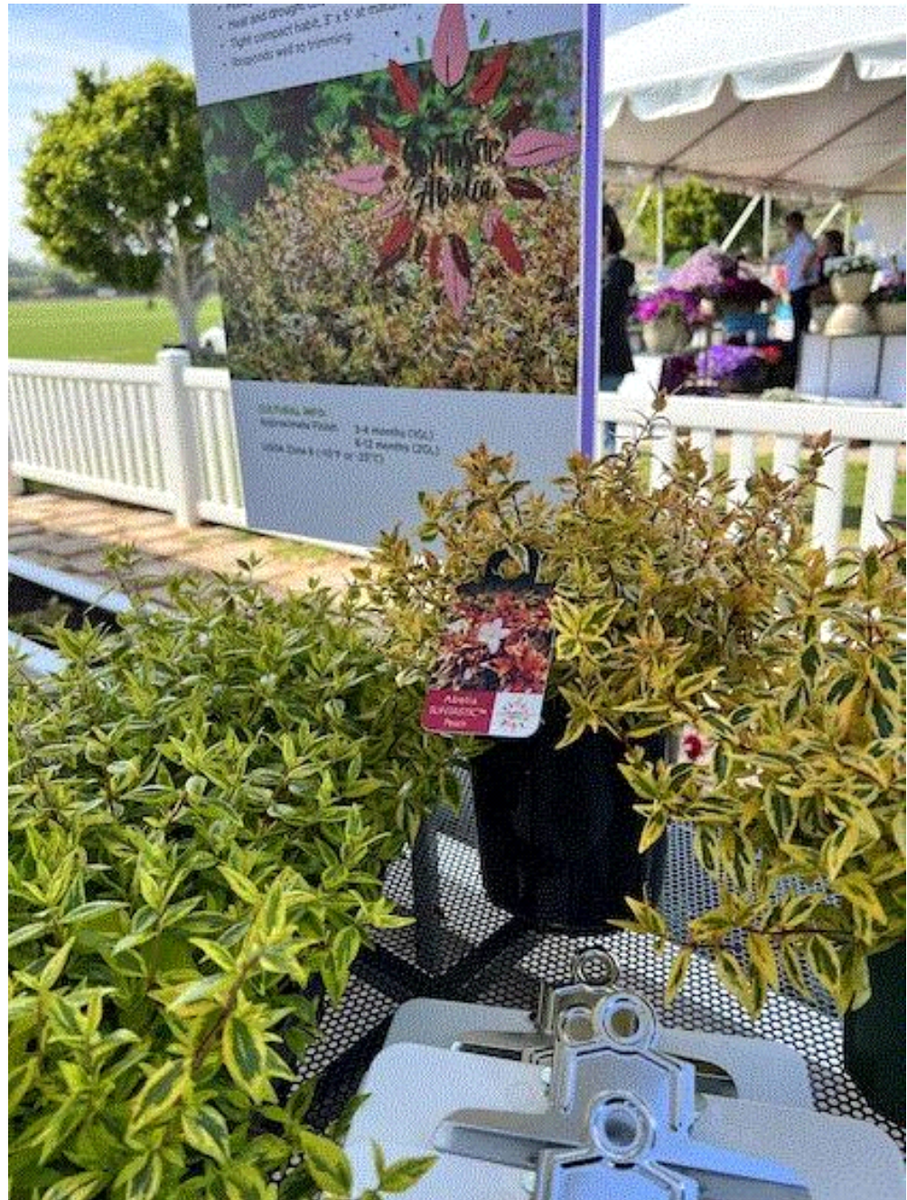
Abelia Suntastic Peach