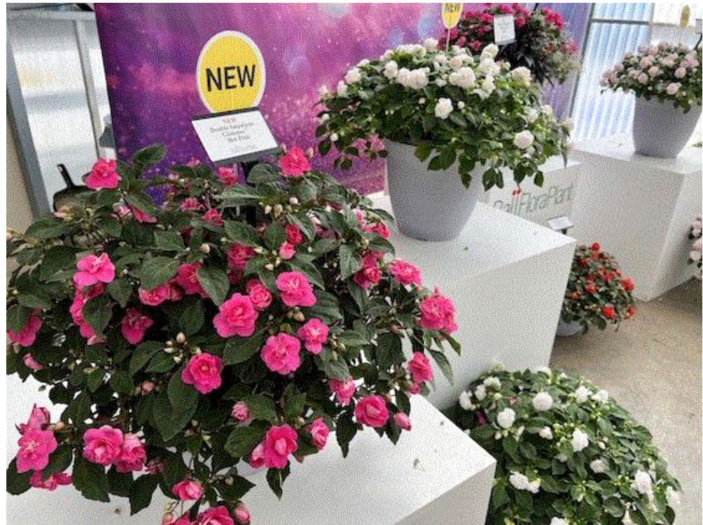
Glimmer Double Impatiens

Bill: That's for sure. I've always liked doubles and it's cool to see them back in the mix.