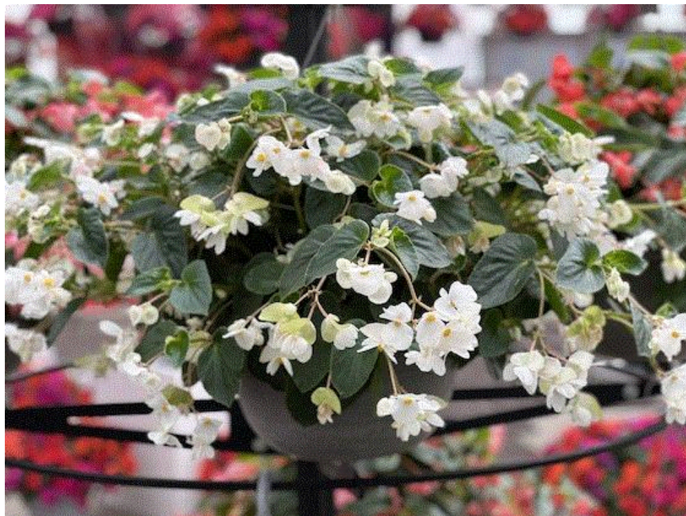
Dragon Wing White Begonia