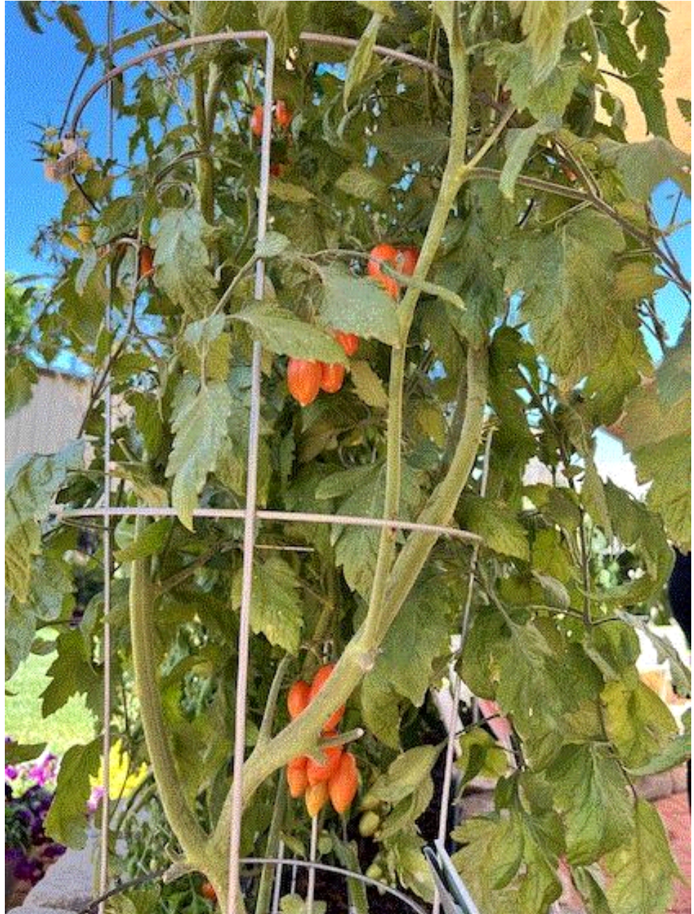
Sun Dipper Tomato