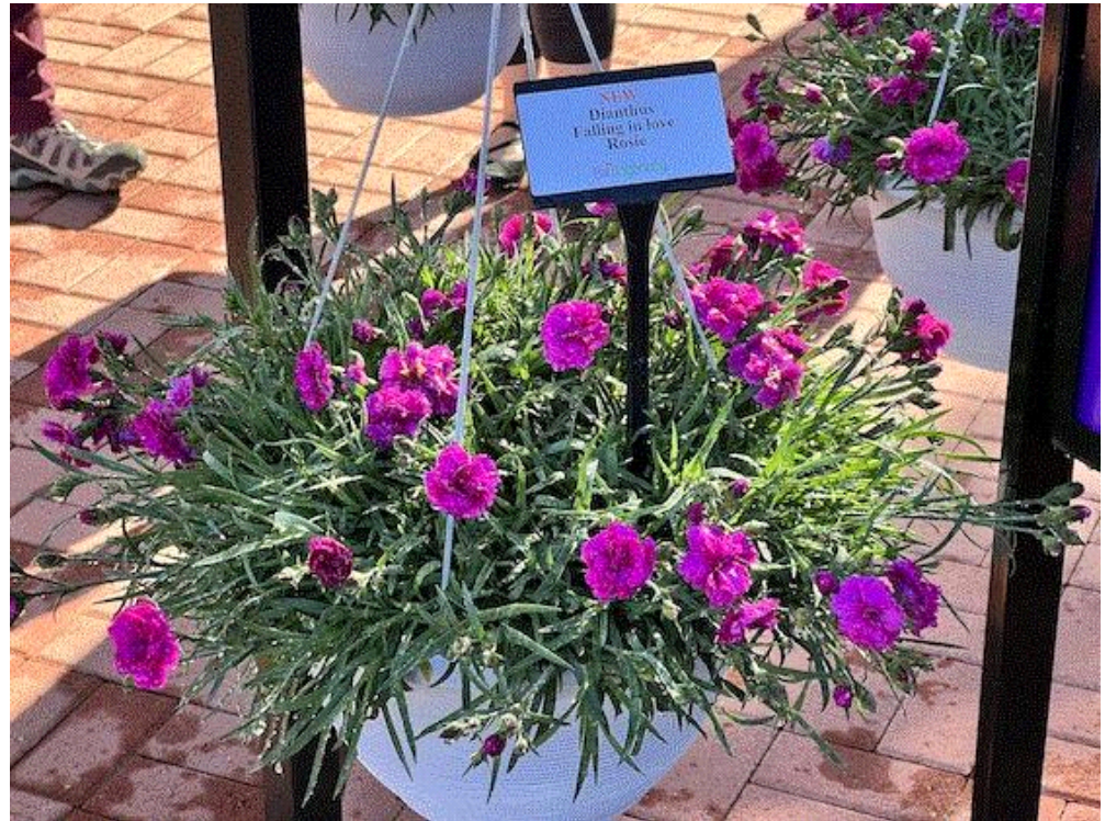
Dianthus Falling in Love Rosie