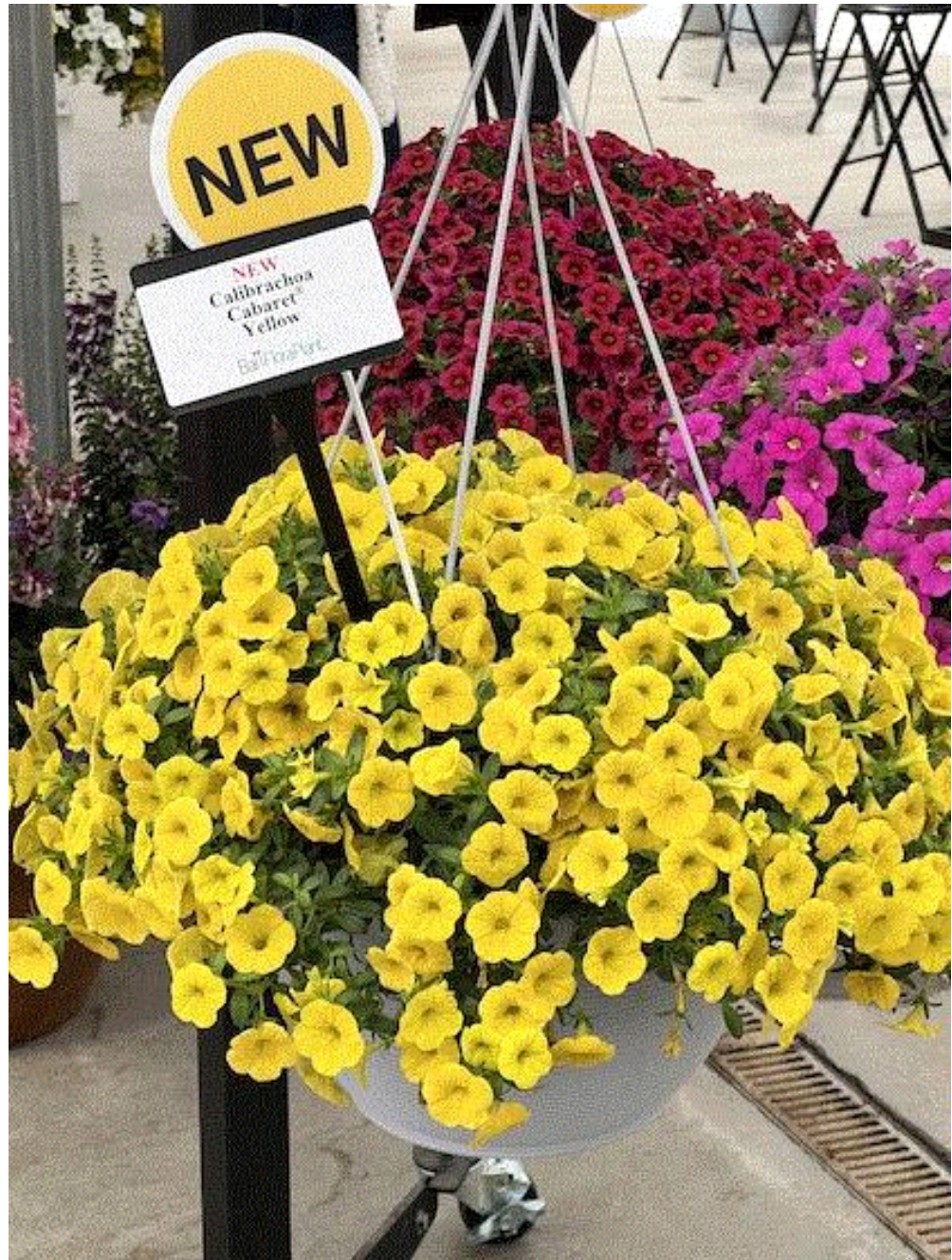
Calibrachoa Cabaret Yellow