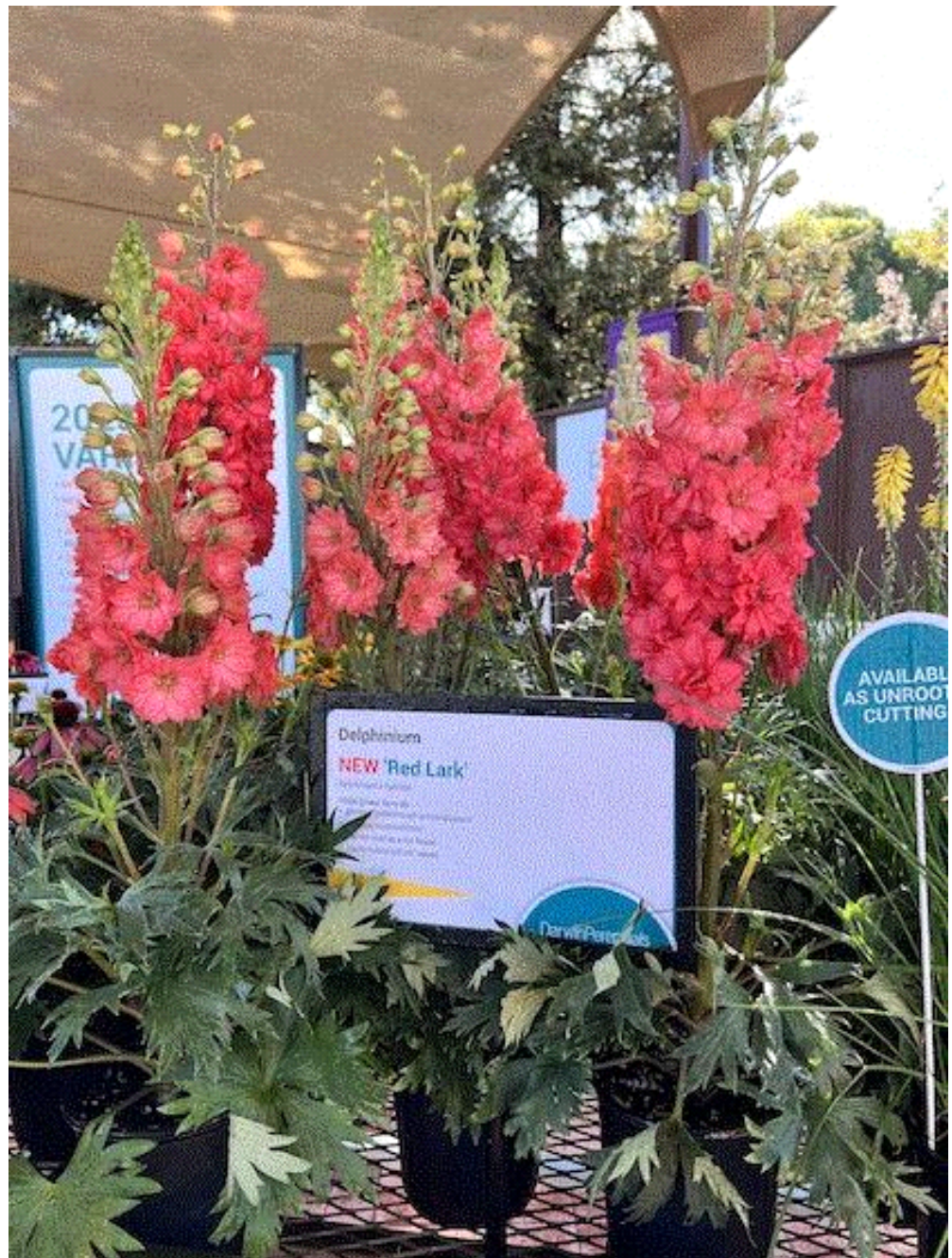
Delphinium Red Lark

Bill: That delphinium is spectacular for sure. Me? I liked Darwin's new Veronica series Skyward. The first two colors are Blue and Pink, and the flower spikes are super sturdy. One of the best attributes of the plant is how dense the structure is, reducing the tendency to split open. It's also shown good powdery mildew resistance in trials, they say.