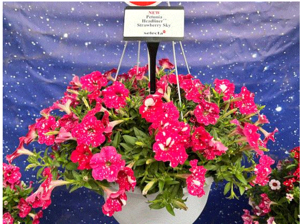
Petunia Strawberry Sky