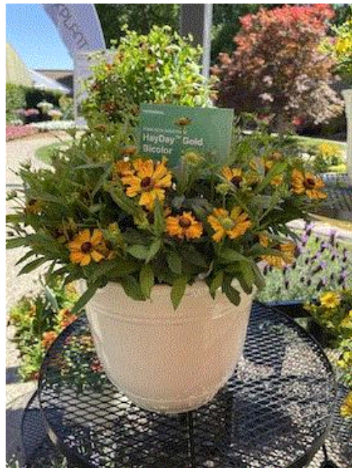
HayDay Gold Bicolor