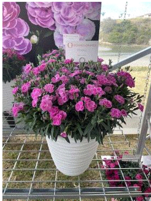
Pemán (rosy pink)

Since I'm on the subject of the great new Pemán Dianthus from Dümmen Orange, I thought I'd take this opportunity to show you a couple more colors in the series.