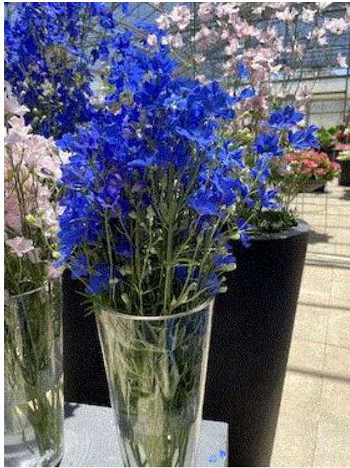
Jenny's Pearl Blue