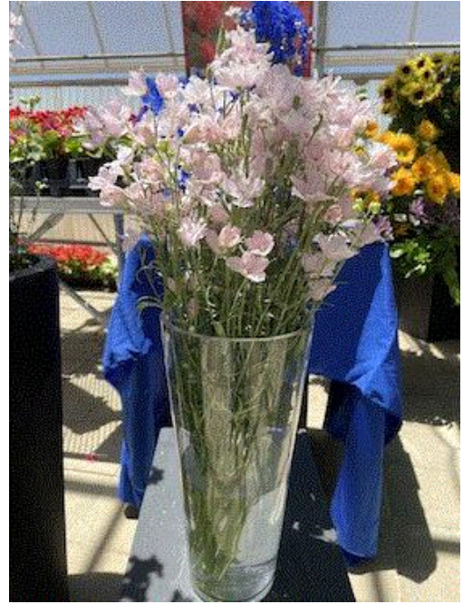
Jenny's Pearl Pink

American Takii has a couple of great F1 cut flower delphinium cultivars I thought I'd pass along. They are Jenny's Pearl Blue and Jenny's Pearl Pink. These are both Delphinium grandiflorum cultivars, which may mean that even though they're not being marketed as perennials, they likely also have some cold hardiness (most G. grandiflorum cultivars are cold hardy to Zone 3). At the very least, they make great cut flowers and offer at least one season of interest when used in containers or gardens.