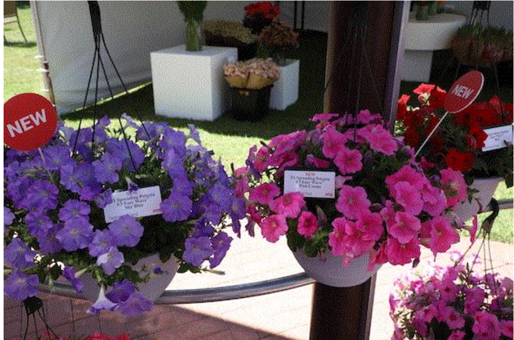
E3 Easy Wave Petunia.