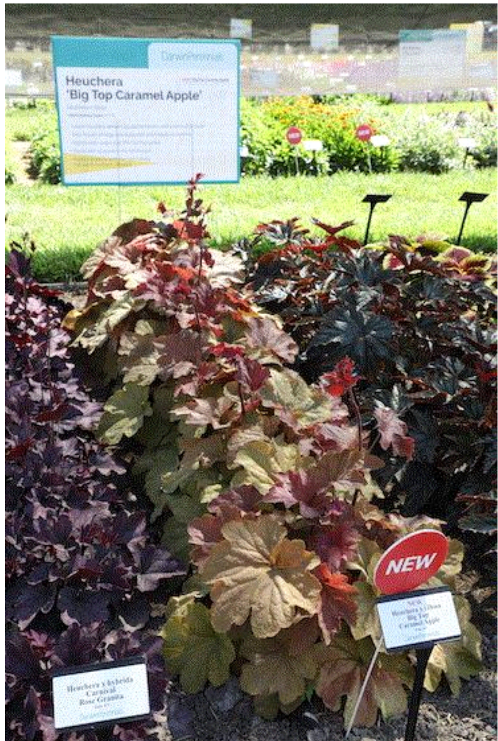
Heuchera Big Top Caramel Apple.

Bill: It's an interesting plant, for sure. But let's get back to more common crops, like heuchera. Shoppers are always interested in what's new with this traditional shade perennial, available in a range of colors. New for 2022 are two from Darwin—Cinnamon Stick and Burgundy Blast join the Carnival series and will go into gallon pots and larger. Big Top Caramel Apple kicks off what could be a future series that's much larger than Carnival with large foliage and a big habit. New foliage starts off red or burgundy and matures to caramel.