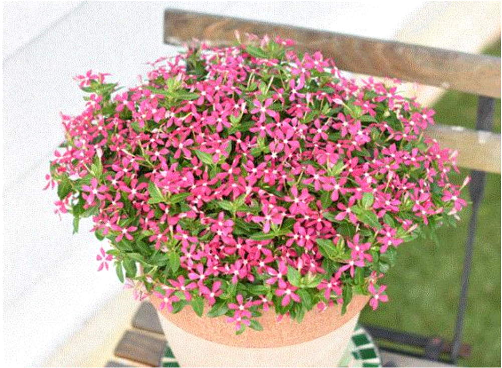
Catharanthus Soiree Kawaii Coral Reef

Perfect examples of this are two new additions to the Catharanthus Soiree Kawaii series (you know, those tiny-flowered vincas). Blueberry Kiss is a stunner, the first in the series to enter the blue spectrum of colors. And Coral Reef adds another tropical color with a more compact habit to fit a slightly different profile in the garden.