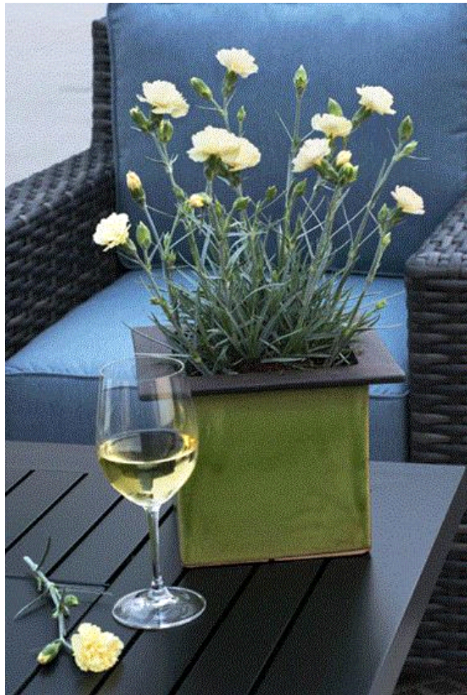
Dianthus Hello Yellow

Hens 'N Chicks fans know that sempervivum tend to look best in winter when few people are out admiring their gardens. The first three intros in PlantHaven's new SemperSemp collection bring the color interest forward to summer, with an added bonus of super-sized plants that are faster to finish than others on the market. Plant a 72-liner in an 8-in. pot and in 20 weeks, you'll have a saleable 8-in. rosette filling the pot.