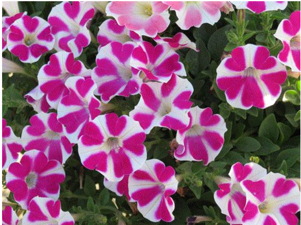
Petunia Surfinia Purple Heart

New for the much-loved Senetti series is a brilliant Violet with contrasting white centers that comes to North America after success in Europe. It matches well with Ruby Red and can be produced for early spring sales.