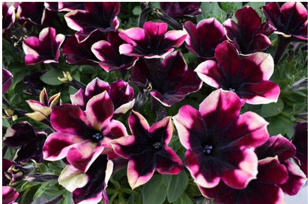
Petunia Crazytunia Blackberry Jam

Another gang within the Crazytunia range are the Friskys, with cream-colored star patterns, which add Frisky Red, Frisky Violet and Frisky Purple this year. The third Crazytunia from Westhoff this year is Blackberry Jam, which might be the coolest of the bunch—it fits into a Blackberry group.