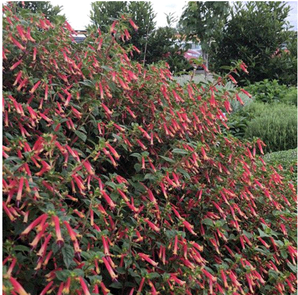
Cuphea Hummingbird's Lunch

He started by introducing two new Cuphea igneas , a large-flowered species from Australia known for its heat and humidity tolerance. First up is Cuphea Blackberry Sparkler blooming with bright and vivid white flowers and red-black tips on a more compact plant that looks great in mixes.