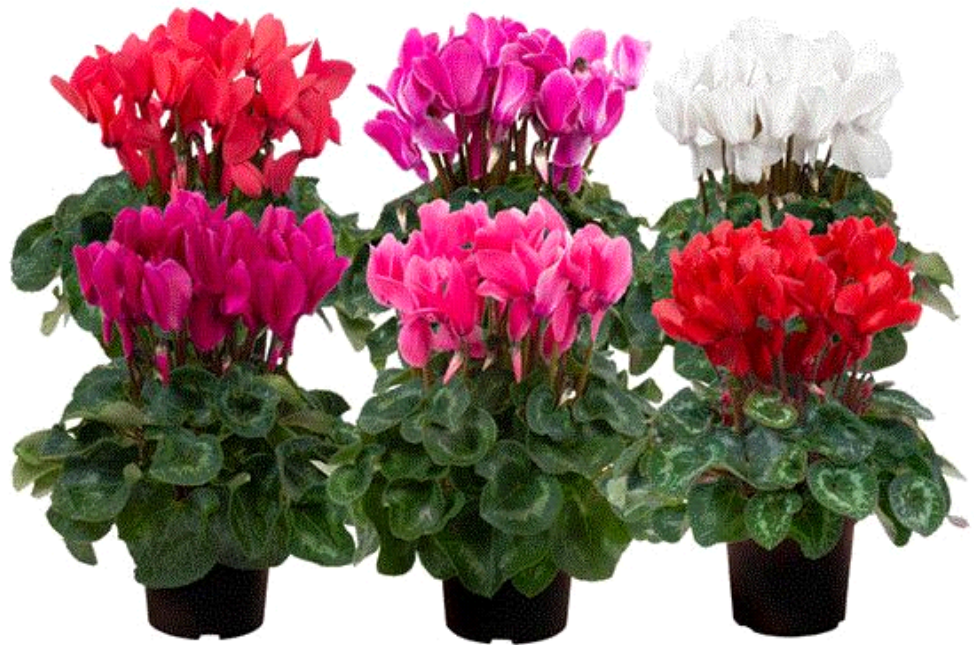
The new Leopardo series of cyclamen.

Leopardo is larger, suited for 6-in. and gallon production. We learned that Schoneveld breeding focuses on high leaf count because every cyclamen leaf has the potential for a bloom.