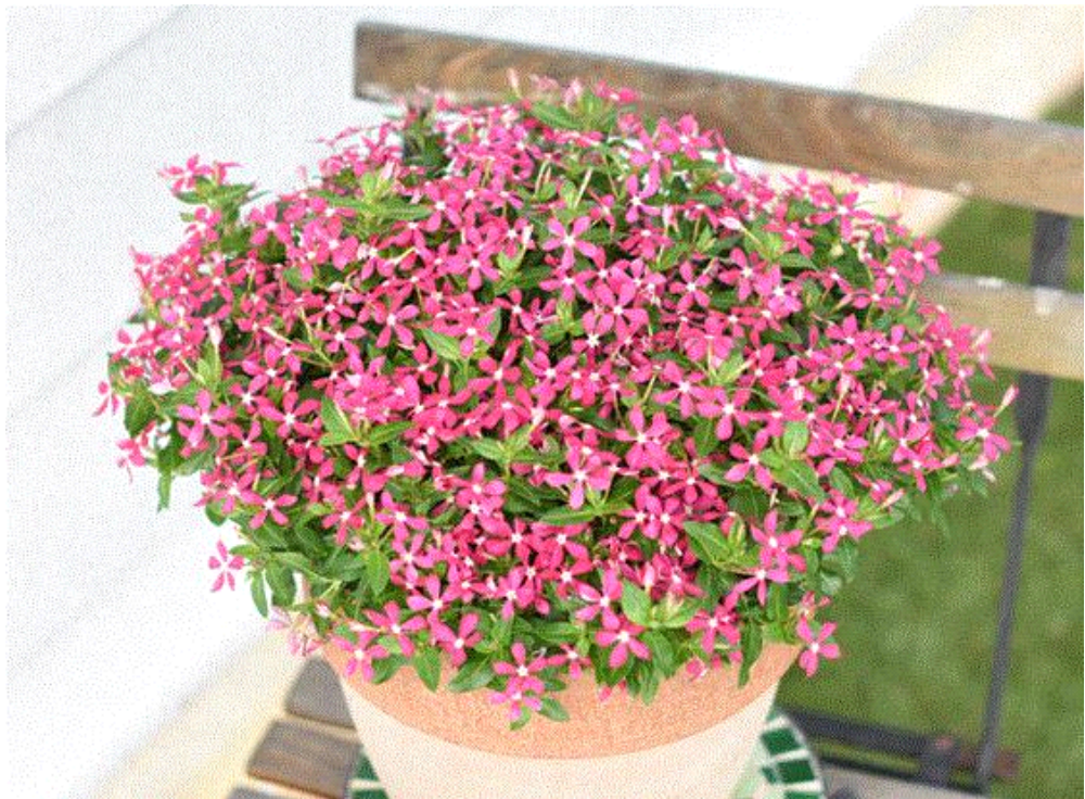
Catharanthus Soiree Kawaii Coral Reef

In Surfinia Petunia, new Purple Heart brings another heart-shaped center to the series. We agree with Delilah that it will be excellent in baskets and containers for cause-marketing campaigns supporting Armed Service members.