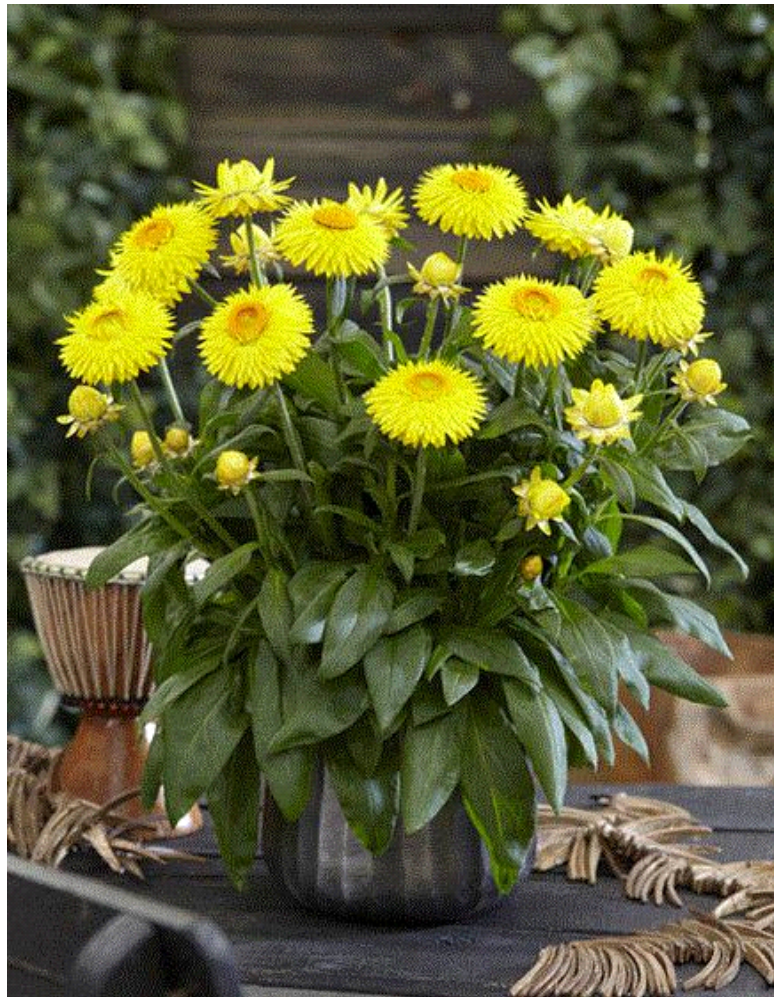
Bracteantha Granvia Gold