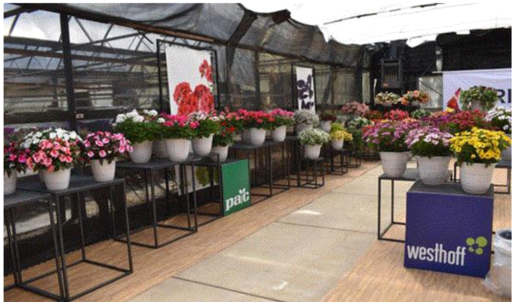
Westhoff set up a rough example of their trial to help us report on it.

Bart explained that one of his goals is to help growers sort out the Crazytunia collection that now includes more than 50 colors and patterns. For instance, now there's a Cosmic group/gang/clique with purple star patterns on huge blooms perfect for 4-in. pots and baskets due to their mounding and upright habits. New for this year is Cosmic Pink, which we all really liked because of its bright and fun color pattern.