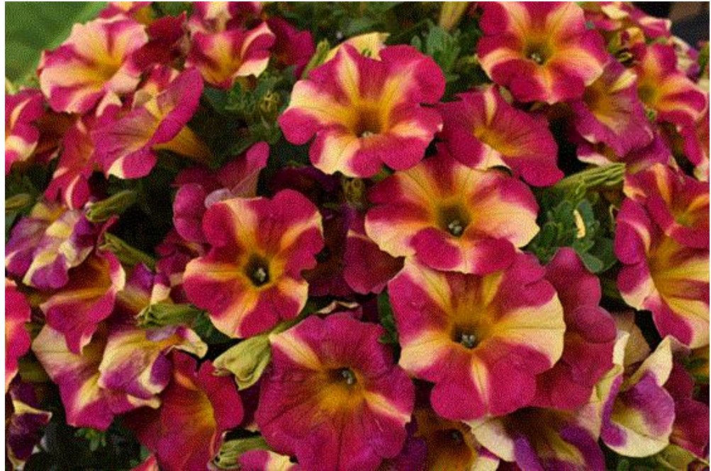
Petunia Peach Bellini

Let's move to calibrachoa starting with two new introductions to the Chameleon series—Frozen Ice and Blackberry Pie. The third new calibrachoa is a standalone, Firewalker, that can be considered a companion to the existing Skywalker due to its sharp terracotta-style color and excellent habit.