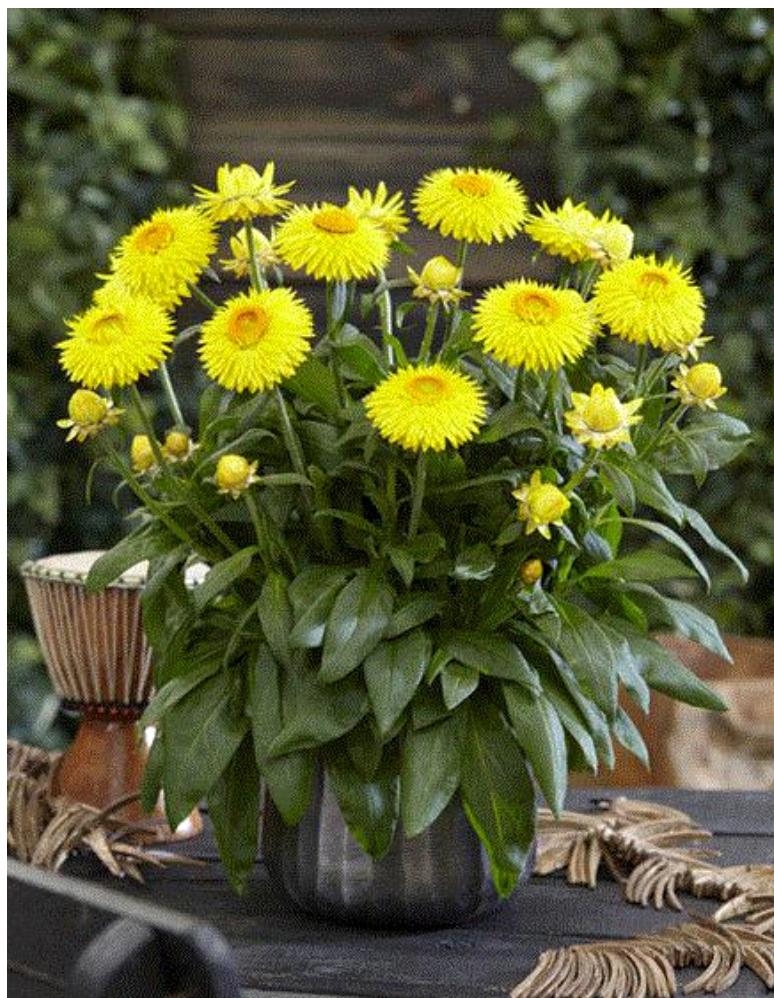
Bracteantha Granvia Gold