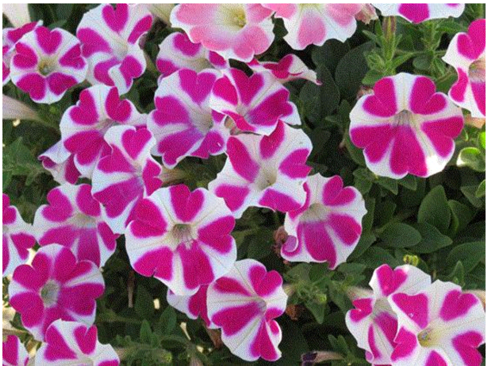
Petunia Surfinia Purple Heart

In Surfinia Petunia, new Purple Heart brings another heart-shaped center to the series. We agree with Delilah that it will be excellent in baskets and containers for cause-marketing campaigns supporting Armed Service members.