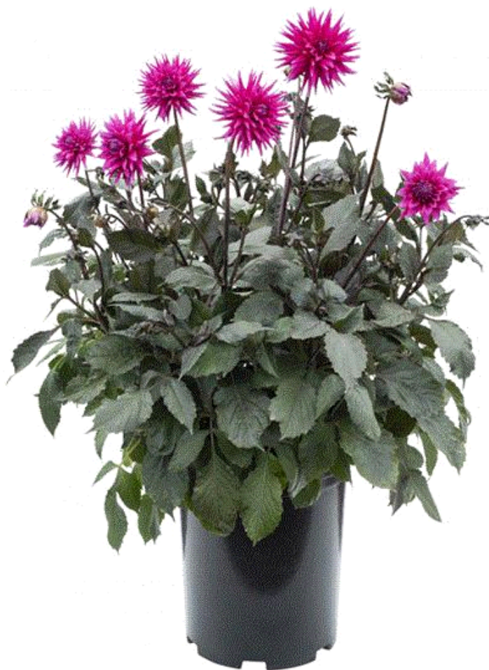
Dahlia Electro Pink

After leaving Australian breeding, Robert took us to New Zealand for the market's first cactus-flowered dahlia with dark foliage. Dahlia Electro Pink is phenomenal. This variety requires no staking, and for growers, it branches after one pinch, growing up to 3-ft. tall in landscapes, making a statement with its 4-in. blooms. Trials show it can be grown for fall sales, too, creating a nice opportunity to complement your garden mum assortment. Root Electro Pink cuttings from Weeks 14 to 20 and send them to market in autumn. Robert told us he's currently evaluating experimentals, which means a series may be on the way soon.