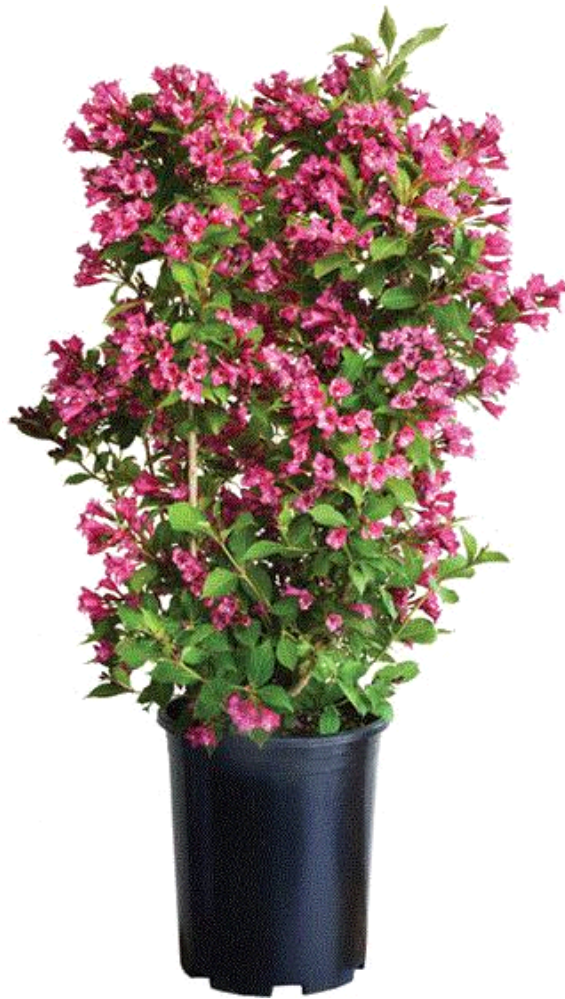
Tower of Flowers Weigela

Finally, PlantHaven introduced a supply chain solution for gaillardia, bringing tissue culture plants directly from a lab in Poland to licensed rooting stations ready to go. Robert says with the REALFLOR Compact series there's no issue getting uniform vegetative material for production, requiring only one pinch. Look for Sunset Cutie, Sunset Flash and Sunset Snappy to start off the series.