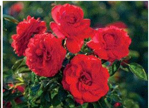
Canyon Road Regional Choice Award Winner in the Northeast, Northwest and South Central regions