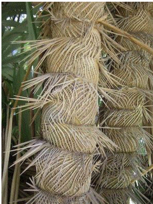
Photographed at the Foster Botanical Garden, Honolulu.

The trunk of the zombie palm appears to be wrapped in burlap with rings of eerie needles protruding around it. In the right frame of mind, perhaps the truck looks somewhat creepy, but I'd say it's far from zombie-like. So why is the genus and common name for this palm named the Zombie palm? I haven't been able to find a clear-cut answer to this question, but I did stumble across some interesting possibilities when looking into this.