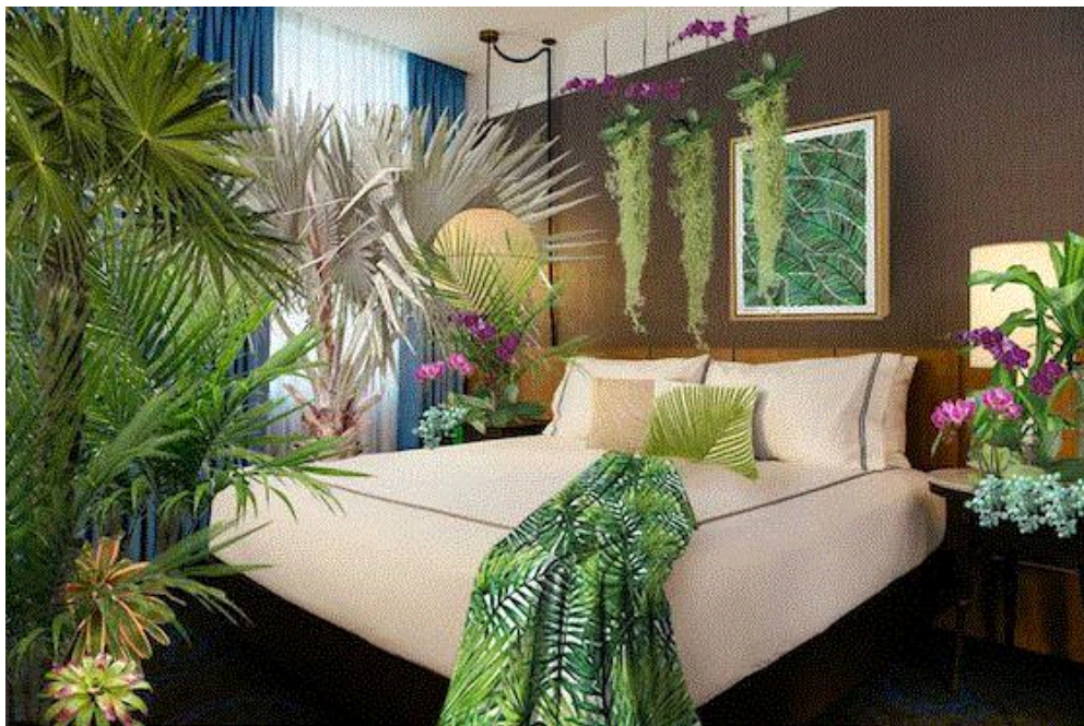
An artist's rendering of what a plant-themed pop-up room at the Kimpton Gray could look like.

The plant theme was inspired by the plethora of information out there about how Millennials love houseplants. But it was thematically inspired by Chicago's Garfield Park Conservatory. Folks booked in the plant-themed rooms also received tickets to the conservatory's plant- and flower-themed fashion event, Fleurotica. Read the Chicago Tribune article about the Orbitz pop-up HERE .