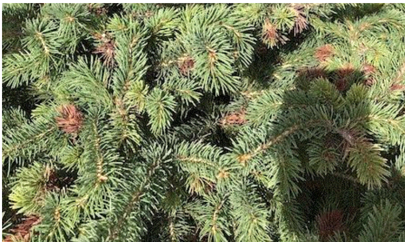
What happened to the Black Hills spruce?