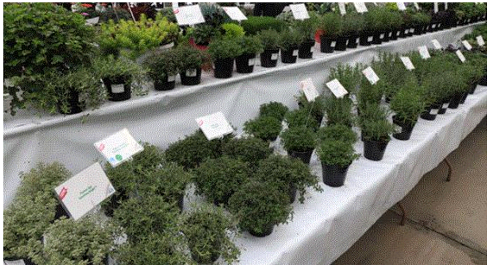
Hishtil's wide range of herbs.