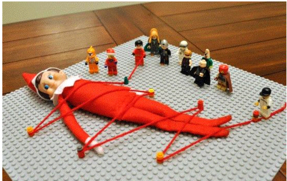
Fear not! No elves were harmed—only detained (except by the Lego fight club) in the construction of this

Well, ladies and gents, we've nearly made it through another calendar year. But before we turn the page, we have to get through the season of giving oftentimes useless gifts for the sake of making ourselves feel a little less of a cheapskate. And if you're like me, you haven't even started shopping yet and have a tinge of guilt associated with giving gift cards every year. So I asked my students and colleagues to send me gift ideas. While a fair number involved elves in NC-17 poses, there were a number of clever ideas suitable for an upstanding publication such as this: