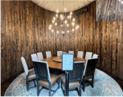
Pictured: An old grain silo has been completely transformed into a very unique private dining area. Wood paneling and a drape hanging from the ceiling cuts down on the echoing.

The garden center has an outdoor area for annuals, perennials, shrubs and hanging baskets, where inside is a wide selection of houseplants, tropicals, succulents and other foliage. At the time, King said they were traveling to Florida (which is where they source all of their indoor plants and tropicals) every two weeks—that’s how fast the inventory was turning.