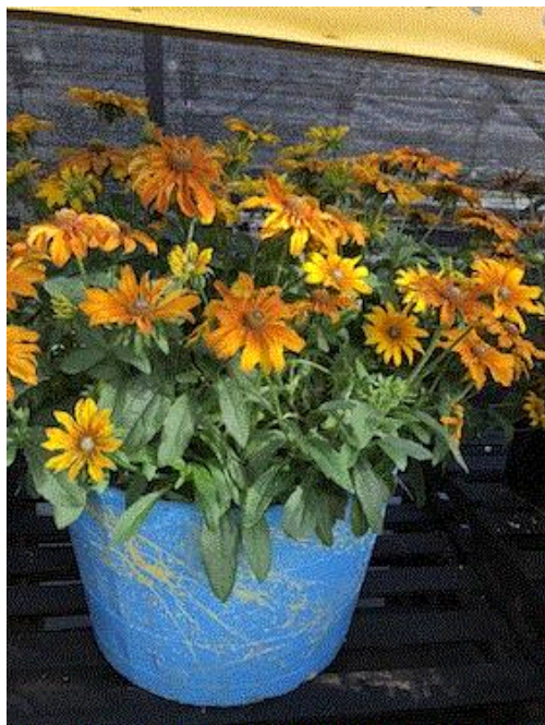
Echibeckia Summerina Butterscotch Biscuit