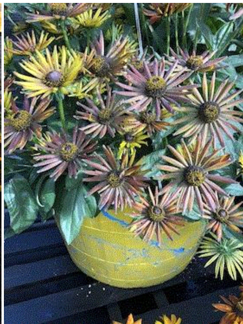
Echibeckia Summerina Electra Shock

Marketing perennials in the fall as decorations rather than perennials will break down mental barriers and allow consumers to simply enjoy them rather than being concerned with where to plant them. It's definitely value-added for consumers who know these plants, but let's face it, most consumers are hungry for attractive decorations rather than planting a landscape. If that's how they want to purchase perennials in the fall, I say let's embrace it and sell all the decorations we can.