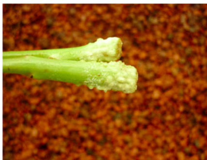
Figure 1. Dipping poinsettia cuttings into a liquid formulation is preferred. Make sure to dip at least \frac{3}{4} of an inch up the stem on the base of the cutting.