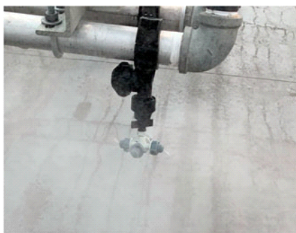
Figure 2. Using fog-type nozzles helps to maintain higher humidity and less free water on the cutting and media, which improves rooting.