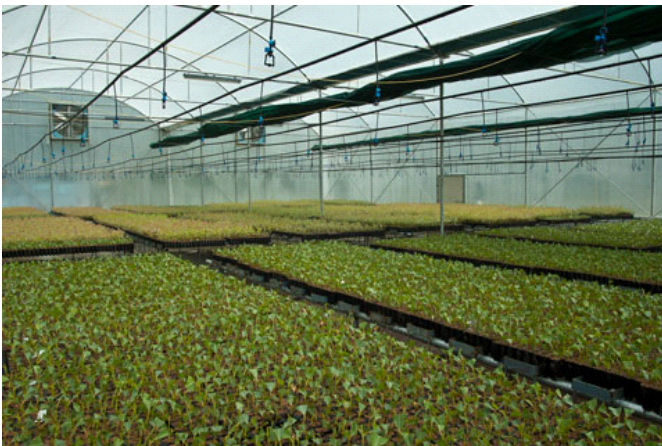
Figure 2. For plant propagation, unrooted cuttings require high relative humidity and adequate moisture content of the growing medium to avoid drying out and to encourage root development. Note the misting system.

The substrate serving as a water reservoir is influenced by its physical properties. For transplant production, a professional germination growing medium is designed to hold enough water between watering events in a small volume cell. This can be achieved by manipulating particle/fiber size; small size particles hold more water due to capillarity (adhesive and cohesive water properties). It's preferable to have a smooth change in particle size because the water retention will change in the same manner as water is depleted from the cell. A single pore size substrate will lose all the water at a certain negative pressure, which gives little leverage when dealing with watering scheduling.