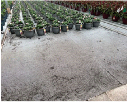
Pictured: Examples of ErfGoed floors with a black membrane (bottom) and a white (top).