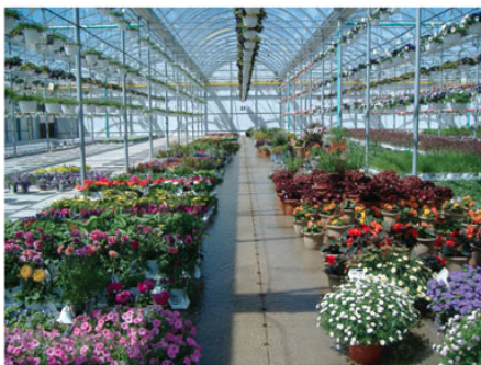
Pictured: A concrete flood floor with and without plants.

Ebb & flood has been one of the most widely used systems for growers since the 1950s where they were first utilized as part of Dutch benching systems. Then through the '70s and '80s, companies introduced entire floor systems to be used in the greenhouse.