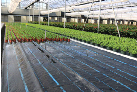
Pictured: Capillary mat irrigation.

Capillary mats consist of a fibrous water-absorbent material that, when irrigation is introduced, wicks evenly throughout its surface. The mats have a plastic underlayment to retain the water from leaching. The fibrous mat material is covered with a permeable plastic, nylon or similar matting that allows the irrigation water to contact the plant container.