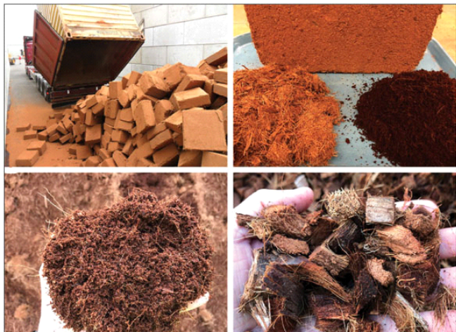
Figure 3. Coconut substrate products are being evaluated for physical and chemical consistencies, and advanced preconditioning methods for product enhancement.

Coconut substrates are utilized extensively in the production of container-grown soft fruits, cannabis and foliage plants, as well as other greenhouse mixes and retail consumer products. Working with the industry to further improve or advance processing and preconditioning methods, and helping to develop novel mixes and product formulations, could help to further bolster the global use and reliance of these substrates