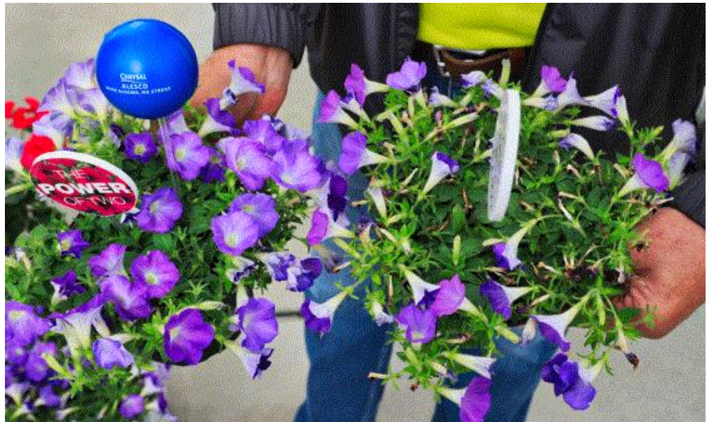
Treated (left) and untreated petunias.