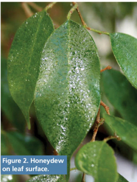
Figure 2. Honeydew on leaf surface.

Sucking insects—such as aphids, leafhoppers, mealybugs, soft scales and whiteflies—feed on plant phloem sap (Figure 1), which transports nutrients, including photosynthates, within the plant. Plant phloem sap consists of carbohydrates (sugars) and nitrogen, and is the primary food source of sucking insects. Most sucking insects prefer feeding on the underside of leaves to minimize exposure to ultraviolet light and obtain easier access to the plant phloem sap. After digestion and assimilation, the ingested phloem sap is modified in composition for transport through the insect gut, and the residue or excess sugar is expelled or excreted out the anus as honeydew (Figure 2).