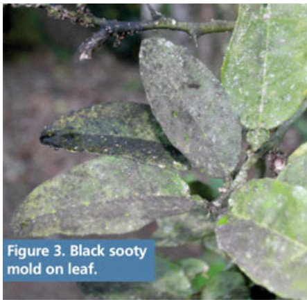
Figure 3. Black sooty mold on leaf.

Aphid parasitoids are attracted to the honeydew produced by aphids, which can increase the searching efficiency of females. In addition, the odors or volatiles emitted from honeydew increases the ability of female parasitoids to locate aphids on plants. Contact with honeydew may also assist parasitoids in determining if prey are present. Moreover, contact with honeydew on leaves may affect the foraging behavior of natural enemies, which can influence the time spent on a leaf searching for prey, thus increasing the likelihood of finding prey (e.g., aphids). Female parasitoids will stop and touch honeydew with their antennae and mouthparts, which allows them to obtain cues regarding the presence of prey within an area.