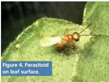
Figure 4. Parasitoid on leaf surface.