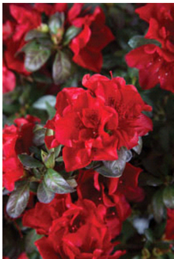
Pictured: Encore Autumn Fire Azalea, bred by Buddy Lee.

Buddy implied a similar theme. He indicated “The world may not need another pink or white reblooming azalea, but people want new cultivars and that drives the market and plant breeding efforts.” What’s more, “the world really could use a yellow-flowering azalea, and while it may be years away, it will happen one day due to continual, incremental improvements.”