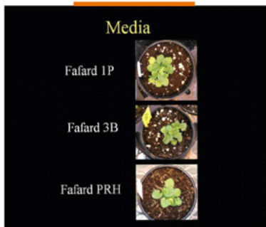
Figure 1. Pansy Delta Orange Blotch transplanted into media containing peat and perlite (Fafard 1P Mix), peat, bark, perlite and vermiculite (Fafard 3B Mix) and peat and rice hull (Fafard Custom RHM).

To our knowledge, no published research currently exists on the effects of parboiled rice hulls on PGR drench efficacy, so we took on a project at Purdue University. Our objectives in this study were to identify the interaction between different media components, PGR active ingredients and application rates.