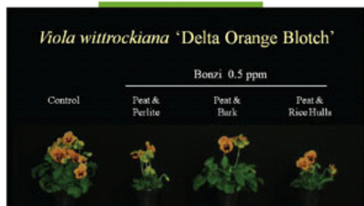
Figure 2. Pansy Delta Orange Blotch untreated and grown in a peat and perlite media (control) or grown in peat and perlite, peat, bark, perlite and vermiculite or peat and rice hull media and treated with a 2.5 fl. oz. drench of 0.5 ppm Bonzi solution.

photoperiod (6 a.m. to 10 p.m.) consisting of natural day length with day-extension lighting provided from high-pressure sodium lamps. We irrigated as necessary with acidified water containing 200 ppm N from a 15-5-15 feed (Excel 15-5-15 Cal-Mag). Plant height (pansies) or length of the longest stem (calibrachoa) was measured weekly, and final measurements were made six weeks after treatment.