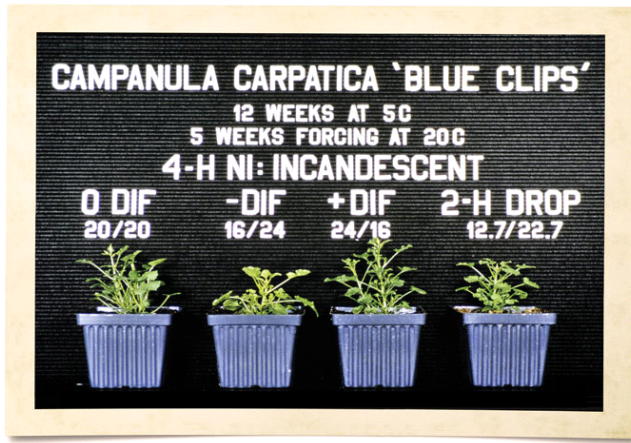
Pictured: Forced perennial Campanula carpatica Blue Clips shows the effects of DIF and DROP on plant height. The most compact plants occur when grown using negative DIF or DROP. Photo courtesy of Dr. Royal Heins, circa 1986.

But at Royal's urging, the desperate grower agreed to try it. The result paved the way for what's now known as DROP or DIP. In this practice, growers lower air temperature around plants at dawn by 5 to 15F for two to three hours. The result? It's similar to growing with a negative DIF: Stems don't stretch. Better still, you don't delay crop time as much as with cool temperatures all