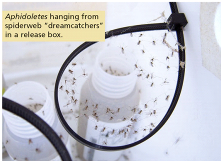
Aphidoletes hanging from spiderweb "dreamcatchers" in a release box.