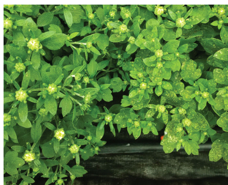
Figure 3. Heavy foliar feeding damage from onion thrips (right) next to an undamaged plant (left). Tightly clustered damaged seems to be a characteristic of this pest.

5. Unlike WFT, OT responds to chemical controls. This includes broad spectrum chemicals like Pylon (clorfenapyr), as well as "softer" chemicals such as Success ( spinosad ) that don't work for the highly pesticide-resistant WFT.