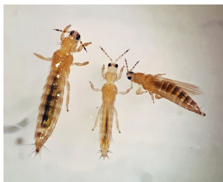
Figure 2. Western flower thrips (WFT) and onion thrips are difficult to tell apart without a microscope. From left to right: Female WFT, male WFT, female onion thrips (Thrips tabaci).

Once we understood the culprit behind these biocontrol failures, we reached out to some of our U.S. counterparts to see if they were seeing the same thing. Consultants in the U.S. have confirmed that onion thrips are being seen in floriculture greenhouses there, although the extent of the problem is currently unknown.