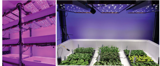
Figure 1. Indoor lighting treatments were delivered on vertically stacked shelves in the Controlled-Environment Lighting Laboratory at Michigan State University.

After the lighting treatments, seedlings of each crop were transplanted into 4-in. pots and grown until flowering in a common greenhouse environment at 68F with a 16-hour photoperiod. We recorded date of visible flower bud, date of flowering, number of flowers or inflorescences at flowering, and plant height at flowering. We performed the study twice and data were analyzed statistically.