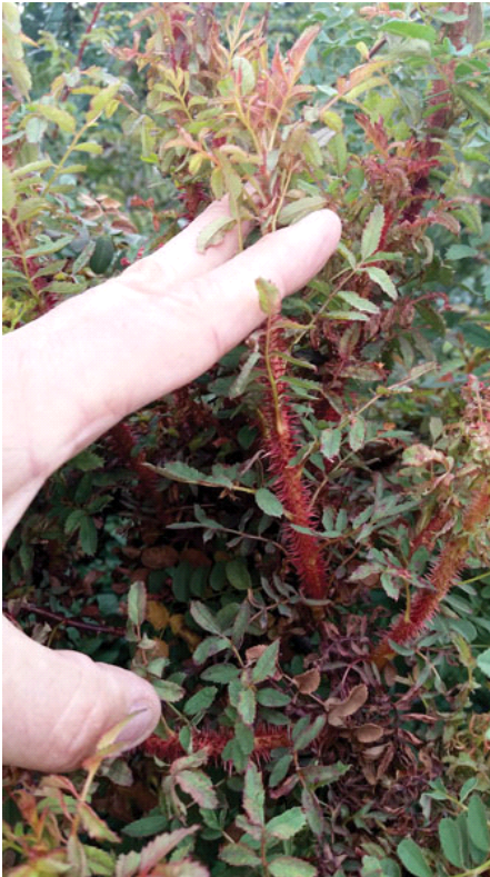
Pictured: Excessive thorniness is another symptom of RRD.

• Other control methods —The frequent approach of controlling RRD in a garden was to eliminate the infected branch, which was ineffective as these plants frequently remained infected. More effective was the rapid bagging and rogueing of symptomatic plants and the use of non-host barriers, such as Miscanthus sinensis , which served to reduce the appearance of symptoms by more than 50%, presumably by blocking the spread of the vector mite.