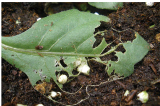
Fungus gnat damage on a dahlia leaf.