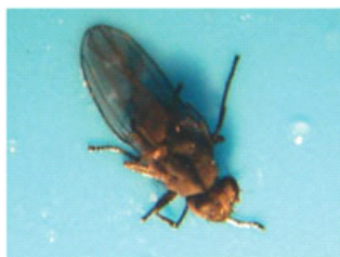
Shorefly adult displaying spots on the wings.