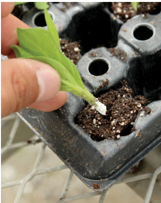
Figure 3. Using rooting hormone.

Step Three: Did you remember to apply rooting hormone before sticking or plan on making a post-stick application? Many times, rooting hormones aren't required; normally under ideal conditions, you may find most crops root fairly well. But the use of rooting hormone applications will promote faster rooting and increase uniformity. Depending on your practice, there are different forms of rooting hormone (powder or liquid) and methods to apply. Two common forms of rooting hormone I see often used are applied to the stems before sticking (Figure 3) or liquid foliar spray applications after stick.