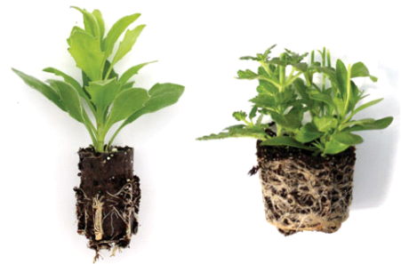
Figure 5. Developed liner (left) and the perfect liner (right).

They're right in the middle, where they can be easily handled and continue their growth in a new container to grow into a fully grown and healthy, mature plant. GT