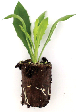
Figure 4. Roots emerging.

Grabbing the liner by the edges and pulling it out is another great way to better examine roots. Once one or two roots begin emerging at the edge of the liner, roots are developing and should have enough strength to move out of propagation and acclimate to their new growing environment (Figure 4).