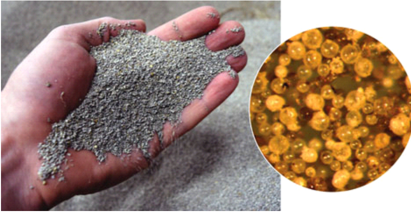
Pictured: Some mycorrhizae have flat granules after it's harvested and processed (left). Others are round, like marbles or pearls, as seen in this magnified close-up of mycorrhizae spores (right).

Most states categorize mycorrhizae as a “microbial additive,” but the term the suppliers like to use is “microbial inoculant.” Mycorrhizae does its job by “joining” with the root cells and spreading out, increasing the size of the root system. This in turn provides a much better environment for water and nutrients to be absorbed into the plant through the roots. It’s a symbiotic relationship between the roots and the mycorrhizae that makes the plant stronger—a tougher plant means it can more easily fight off any disease or stressor.